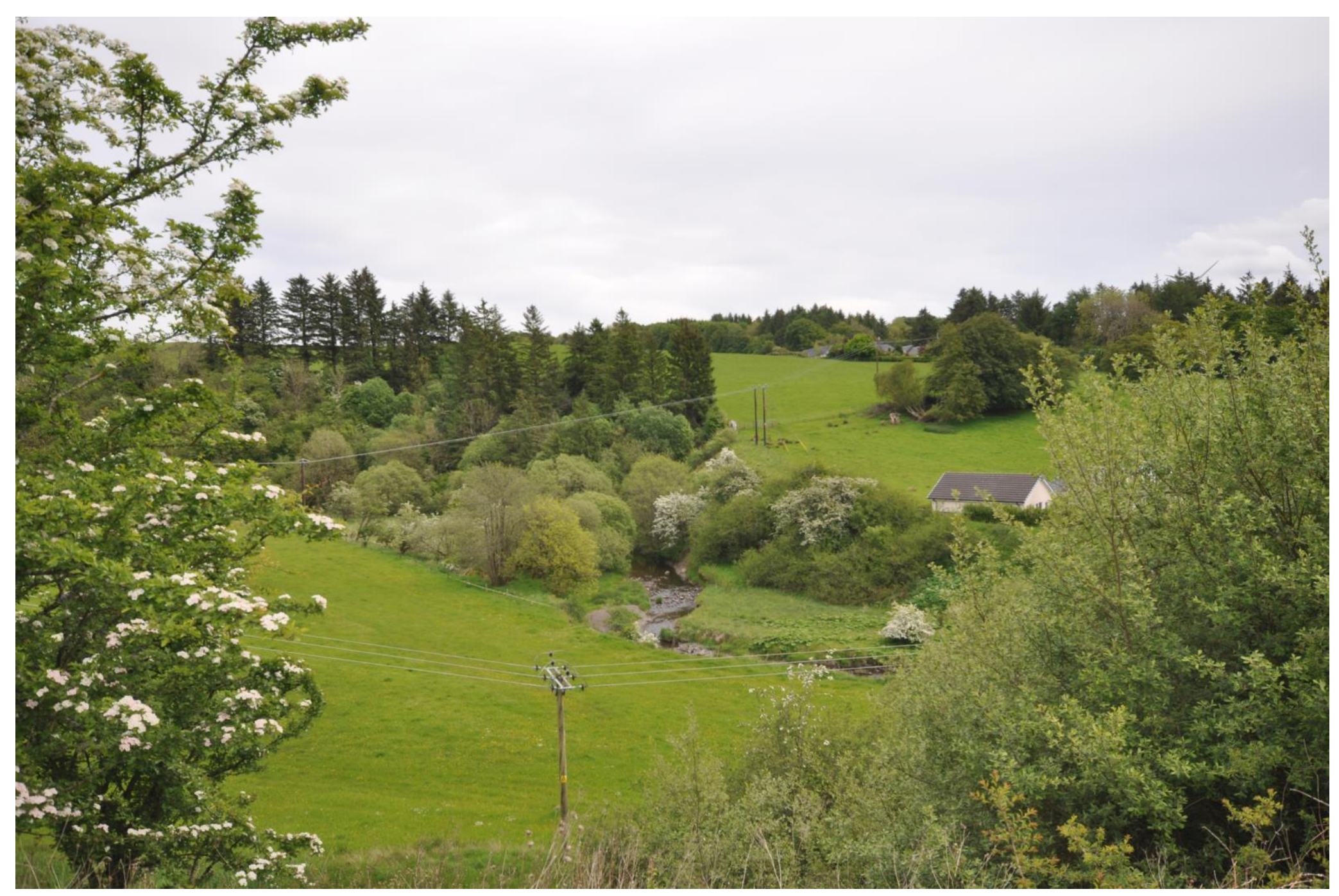
View from Plot