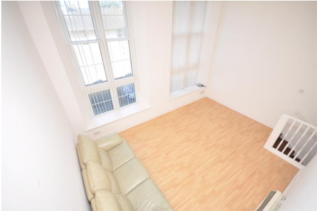
Living Room looking down from mezzanine bedroom