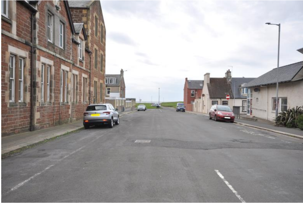
View along Ailsa Street West, toward the beach