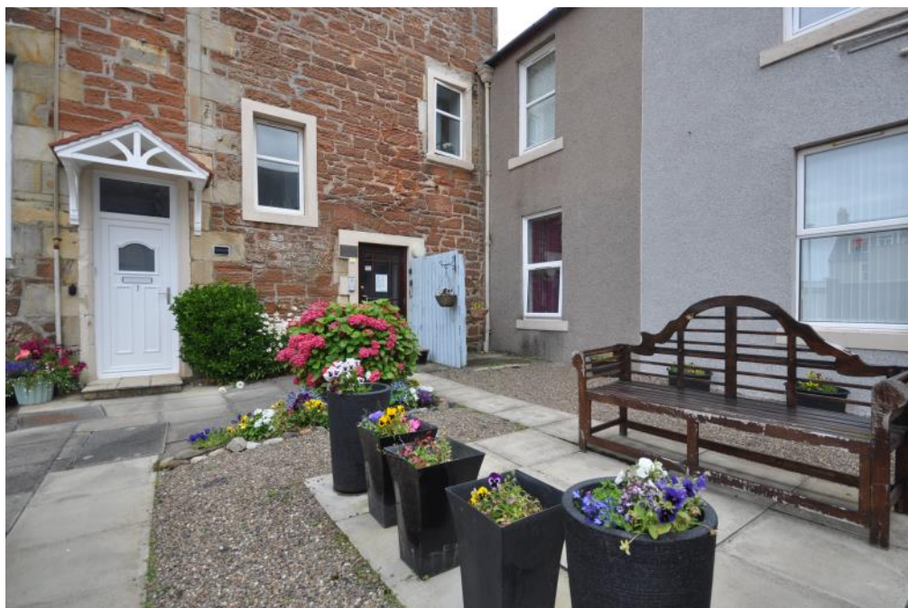
Harbour Lane Entrance, enter building through brown door