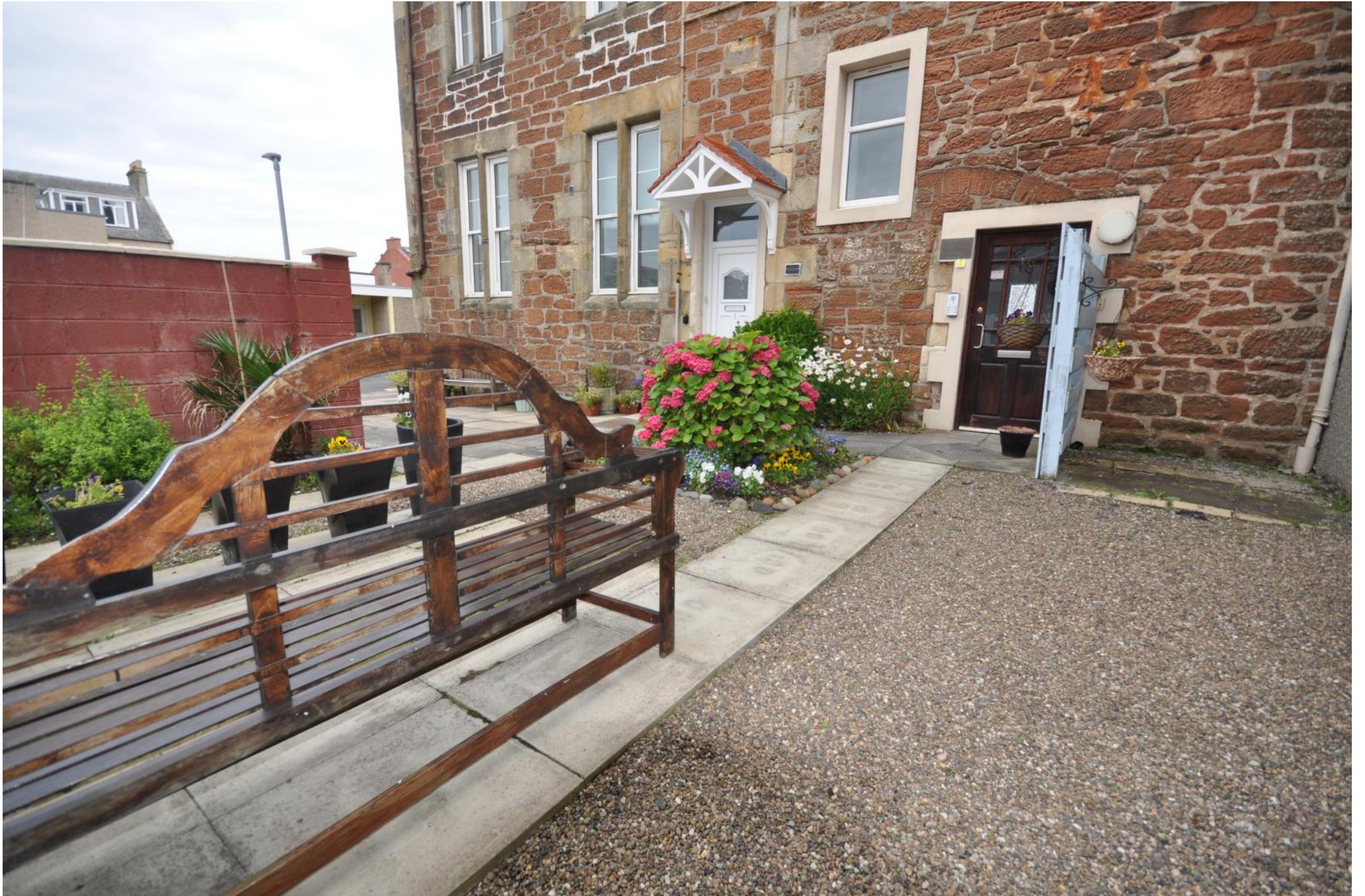
Entrance from Harbour Lane through brown door