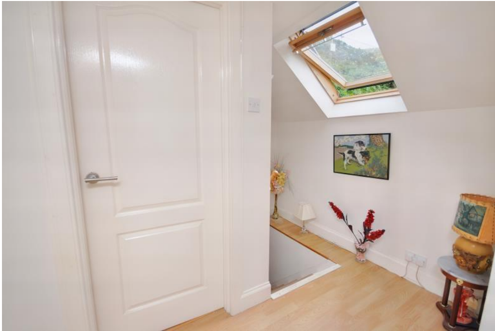
Landing / Stairwell