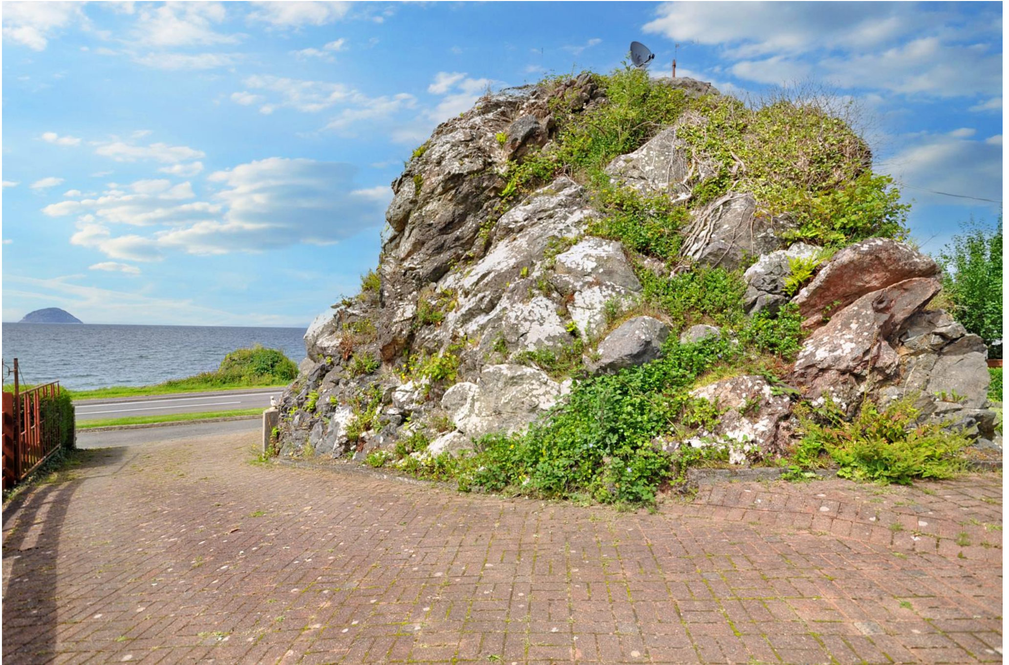
Drive and view