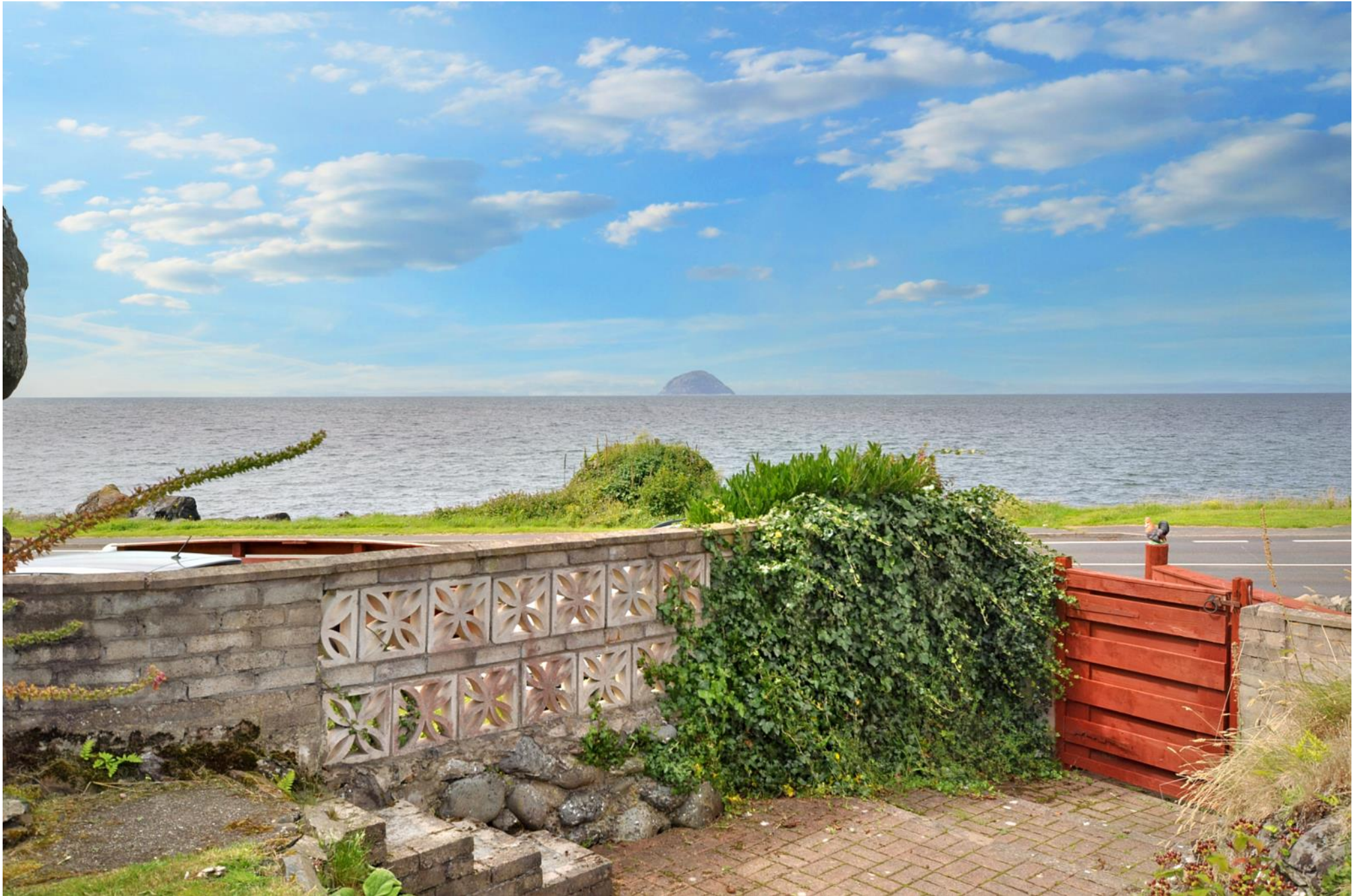
View from property