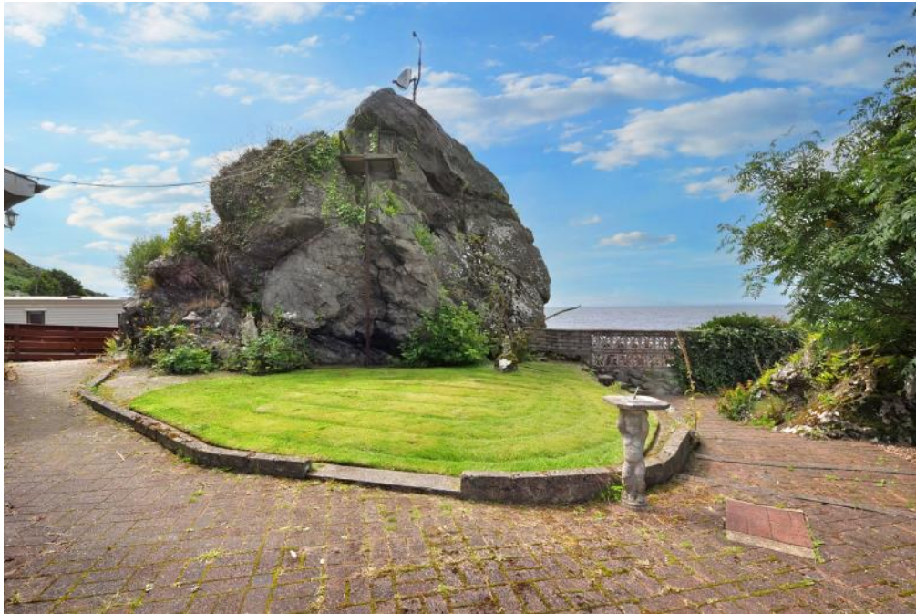
Front of house