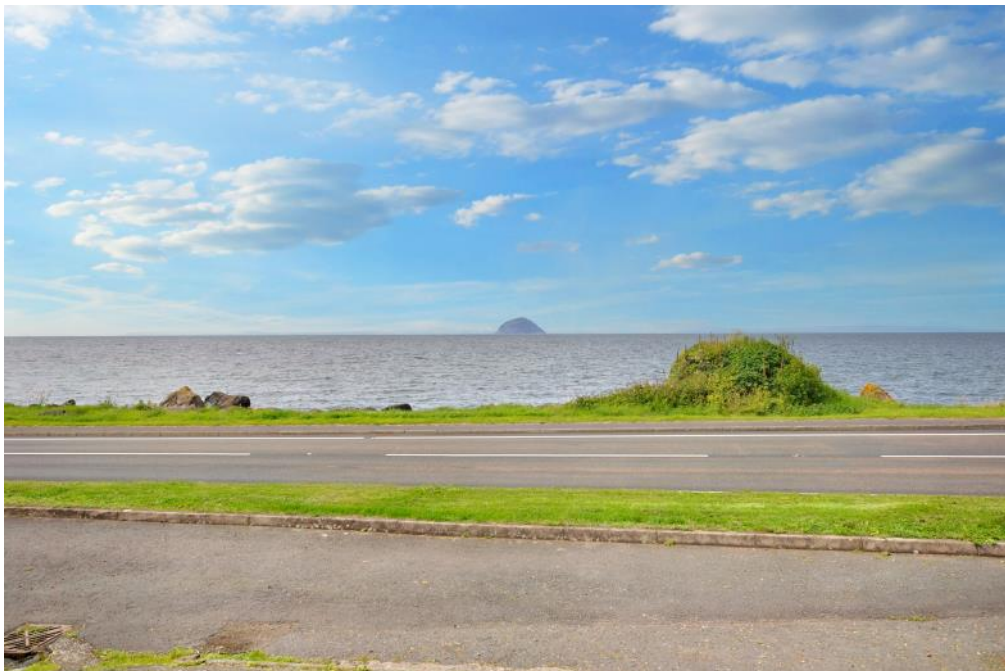
General Surroundings and view from house