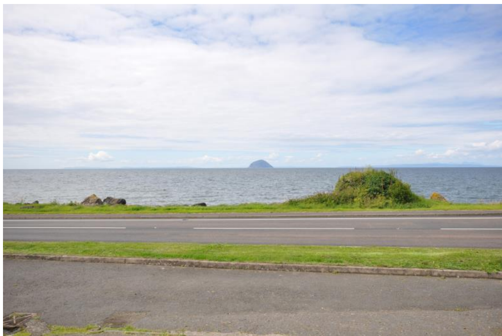
General Surroundings and view from house