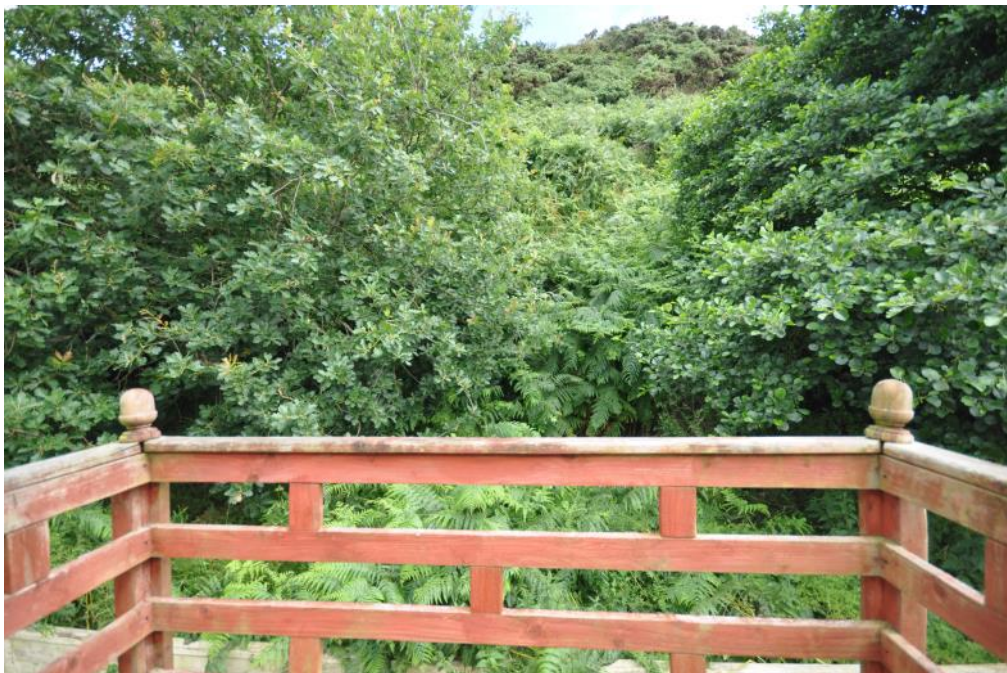
View from balcony