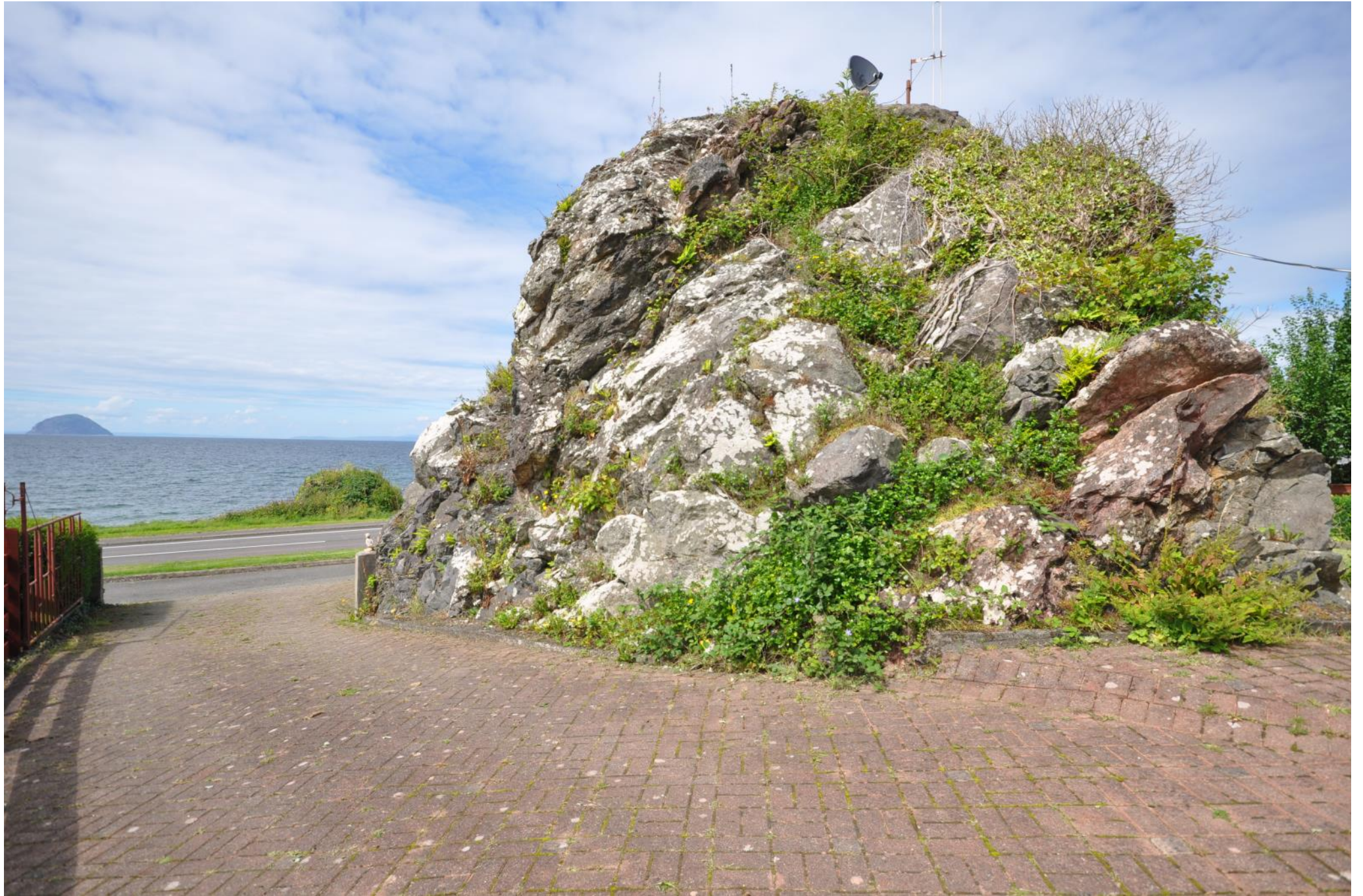
Drive and view