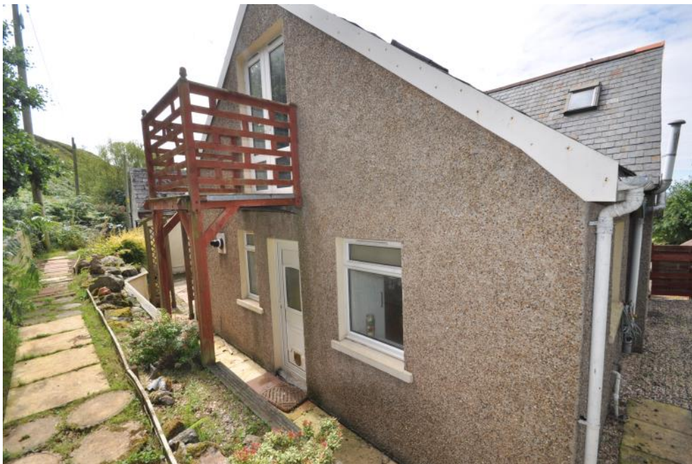
Back of house