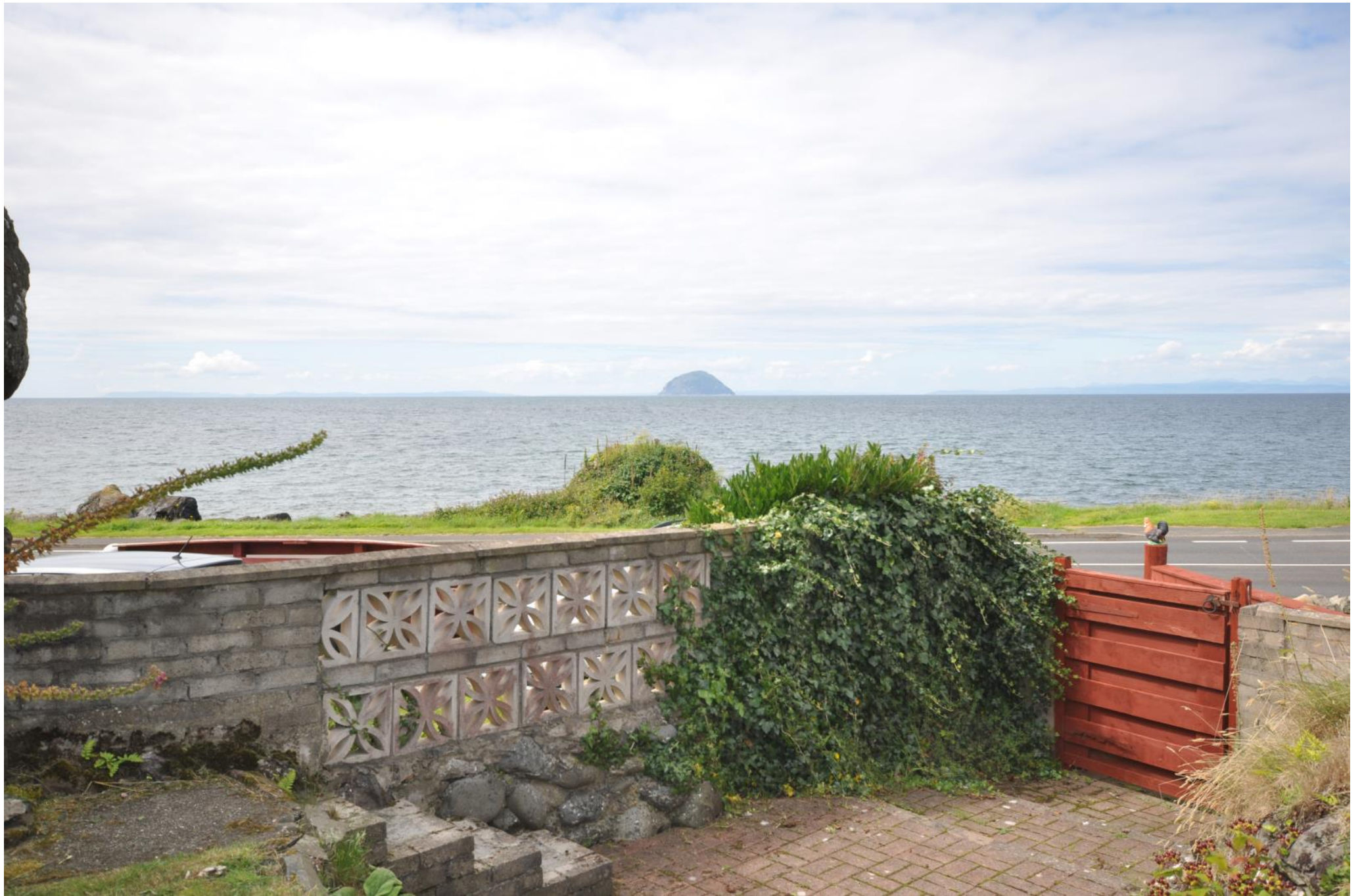
View from property