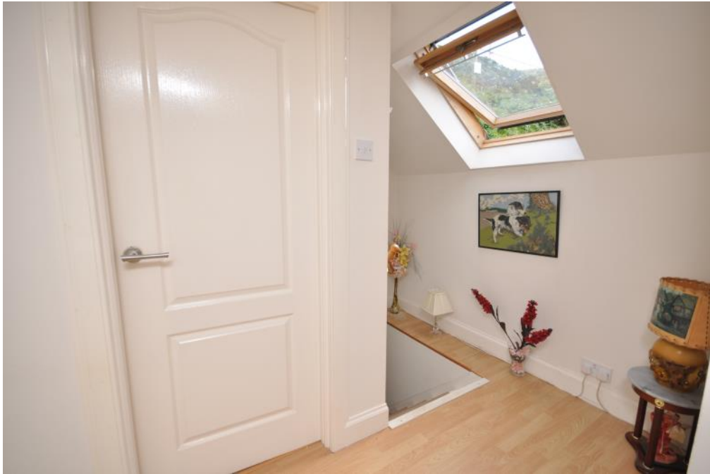
Landing / Stairwell