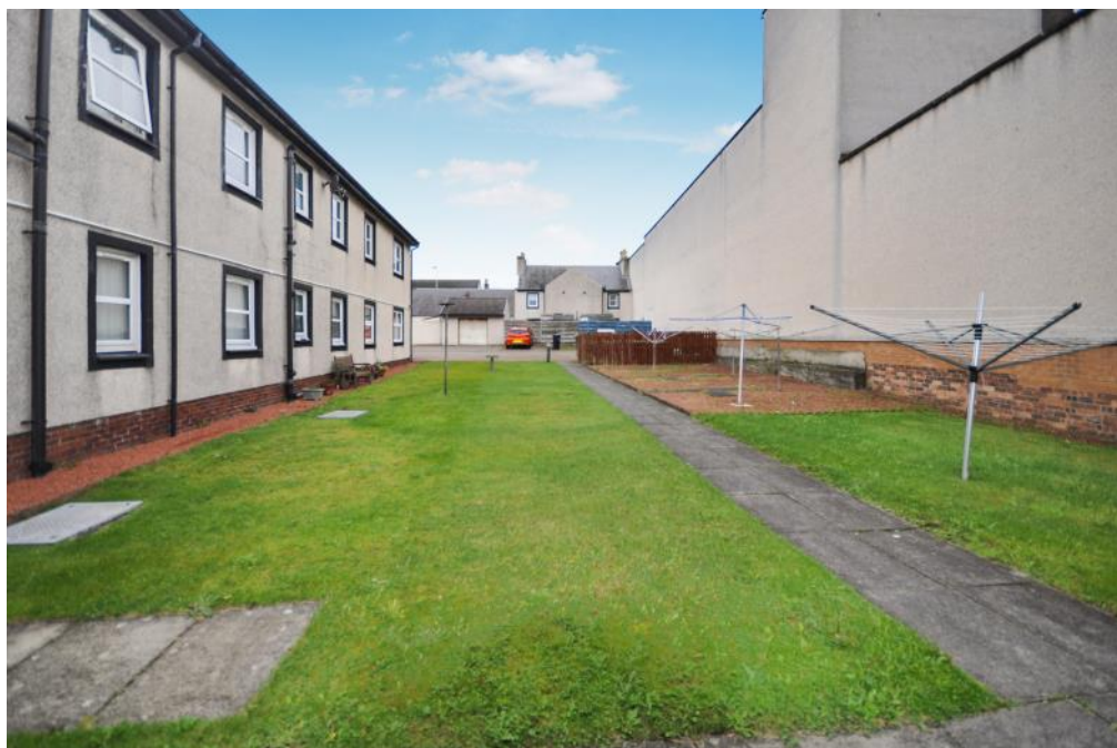
Communal lawn, drying area and path toward car park