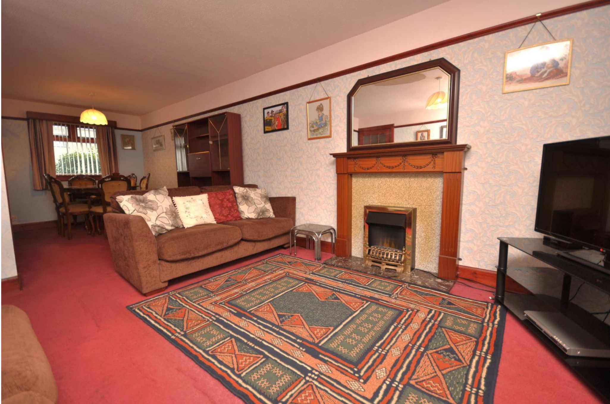
Living Room / Dining Area