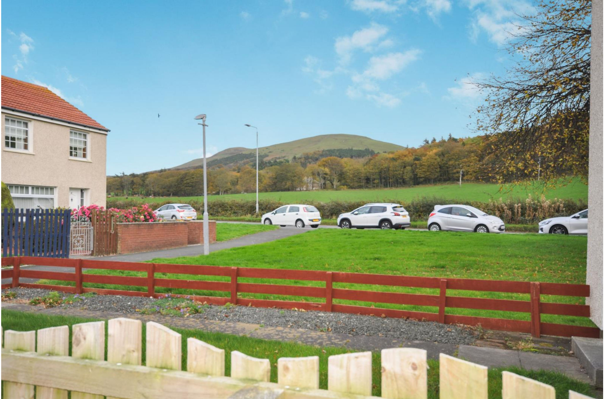
Outlook from front garden