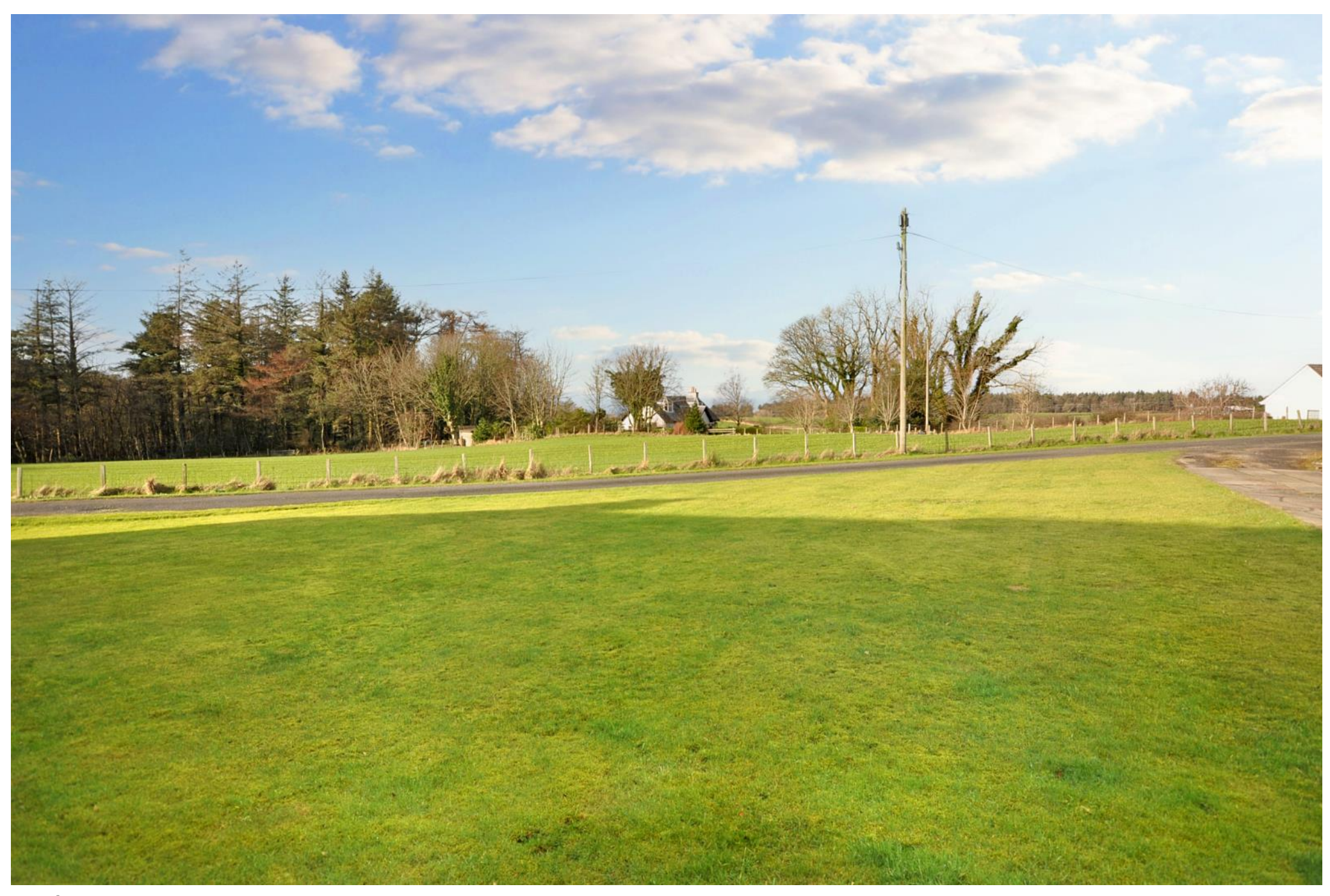
View from Front