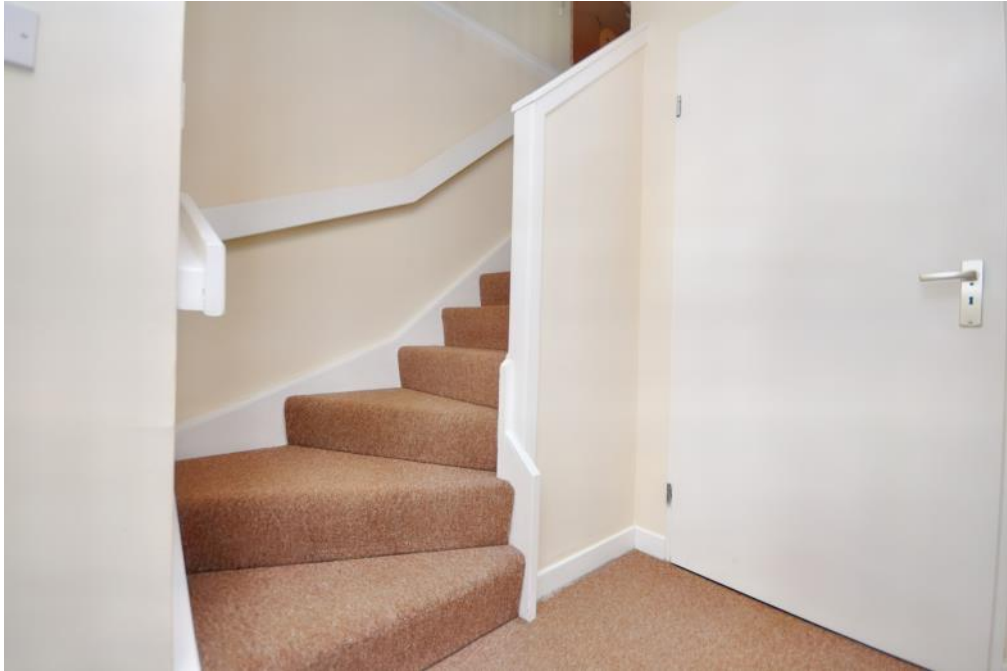
Lower Ground Floor Hall