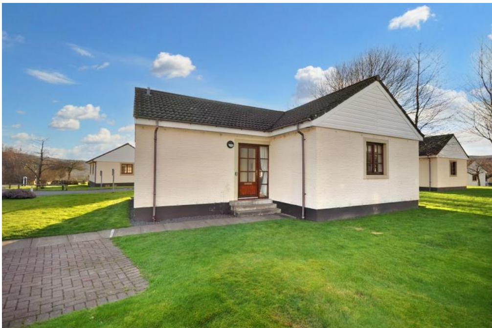
Side Elevation and Entrance