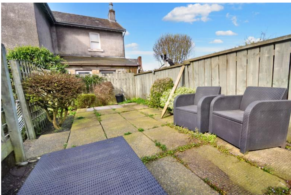
Back Patio Area