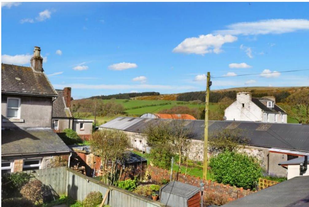
View from Bathroom Window