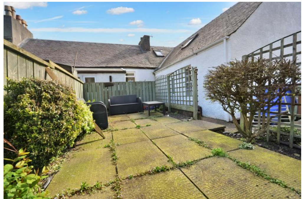
Rear Patio Area