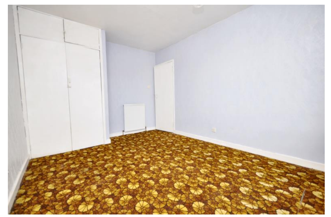
Bedroom 2 Bedr