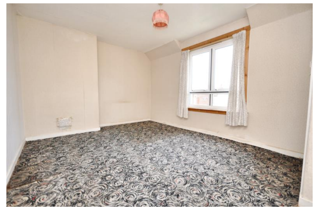
Landing Bedroom 1