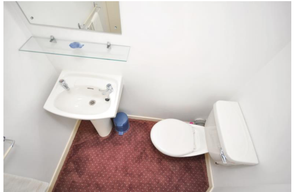
En Suite WC & WHB