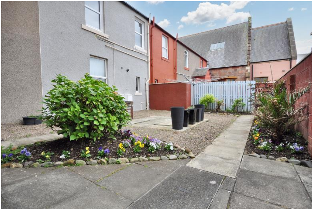
Communal Drying Green