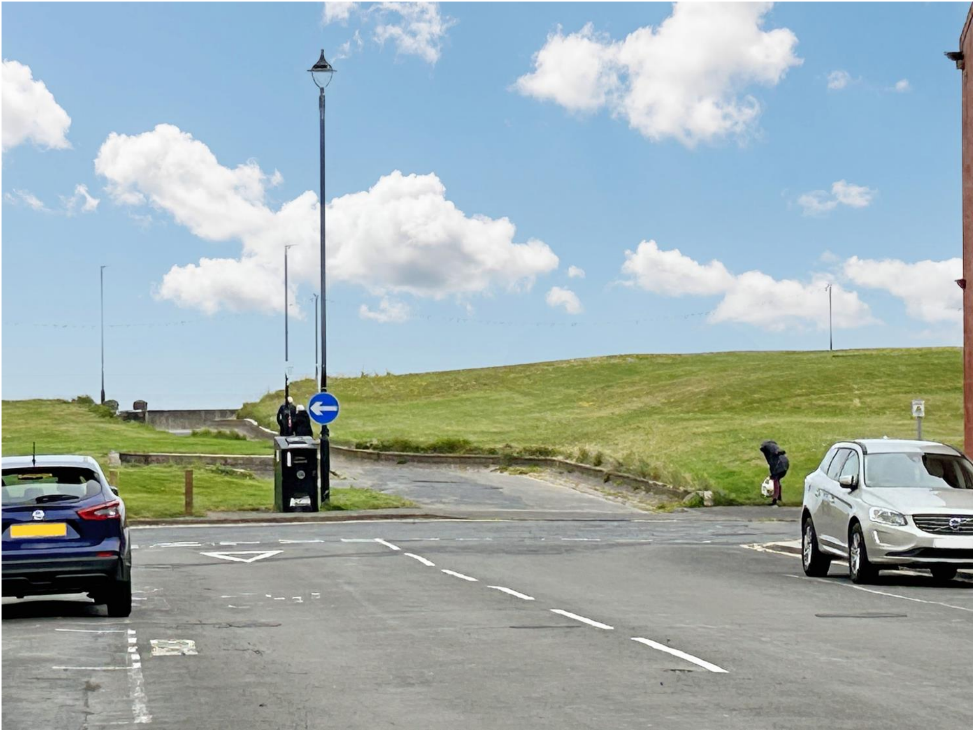
View from Ailsa Street West to Beach