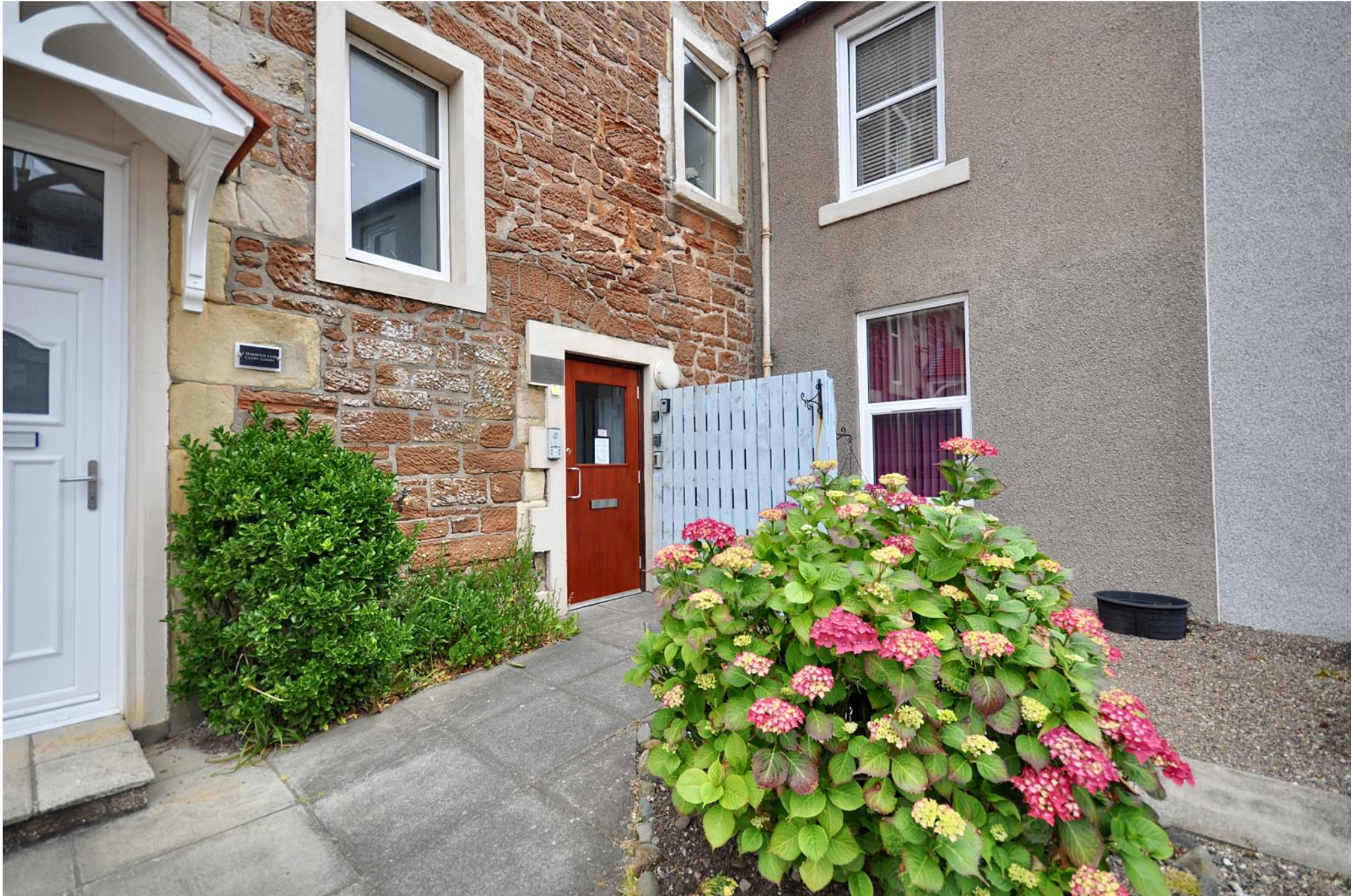
Harbour Lane Entrance