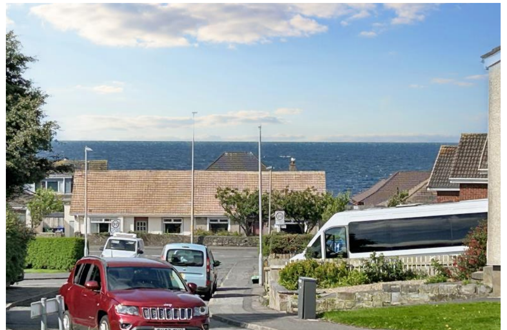
View from Front Garden