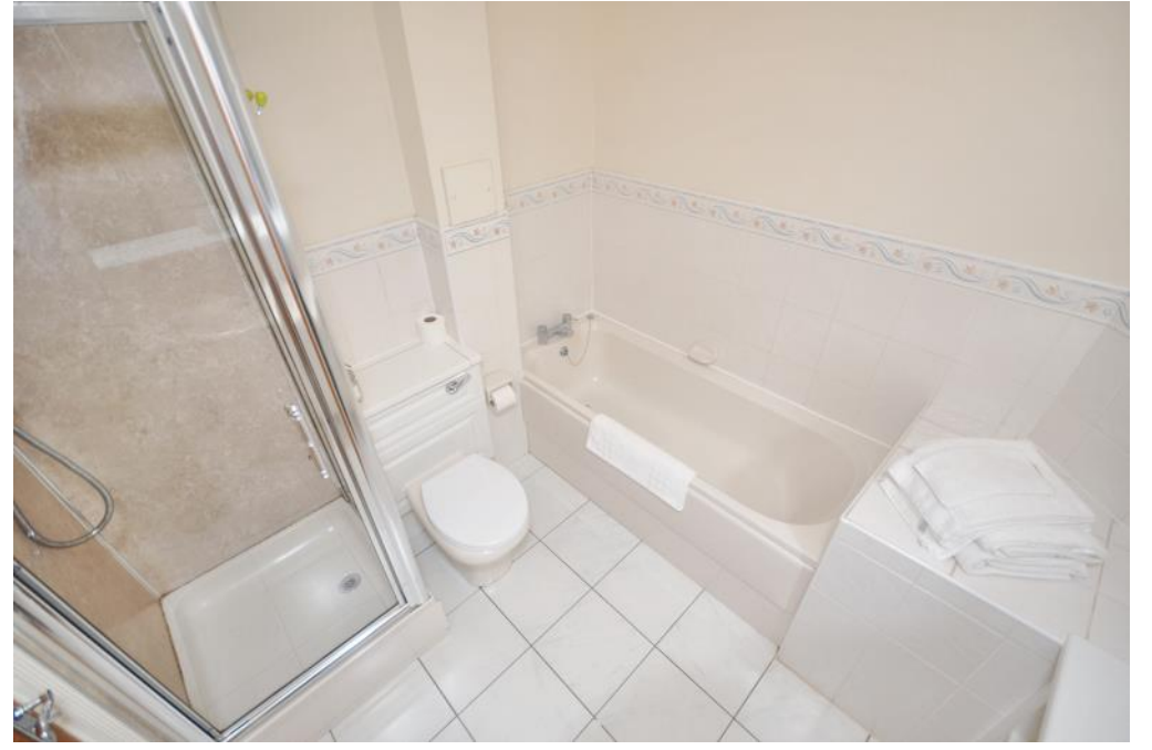
En Suite En Suite