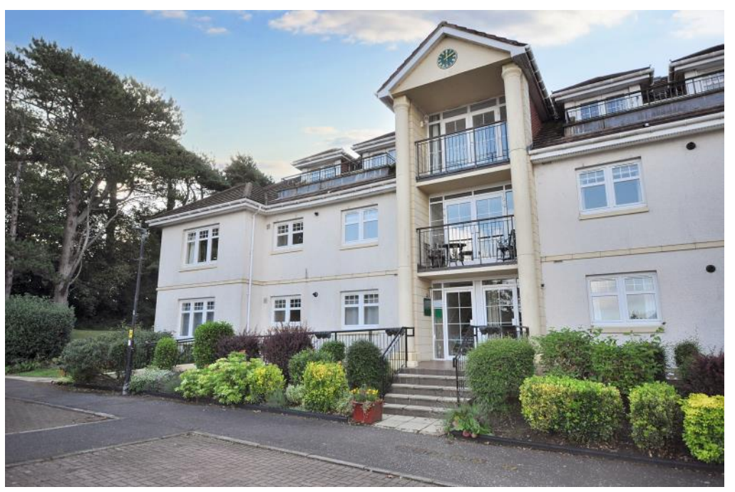
Hall Front Elevation