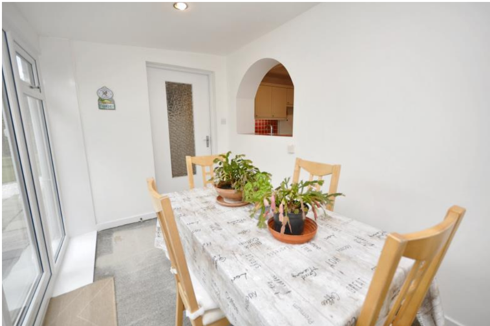
Dining Area/Garden Room