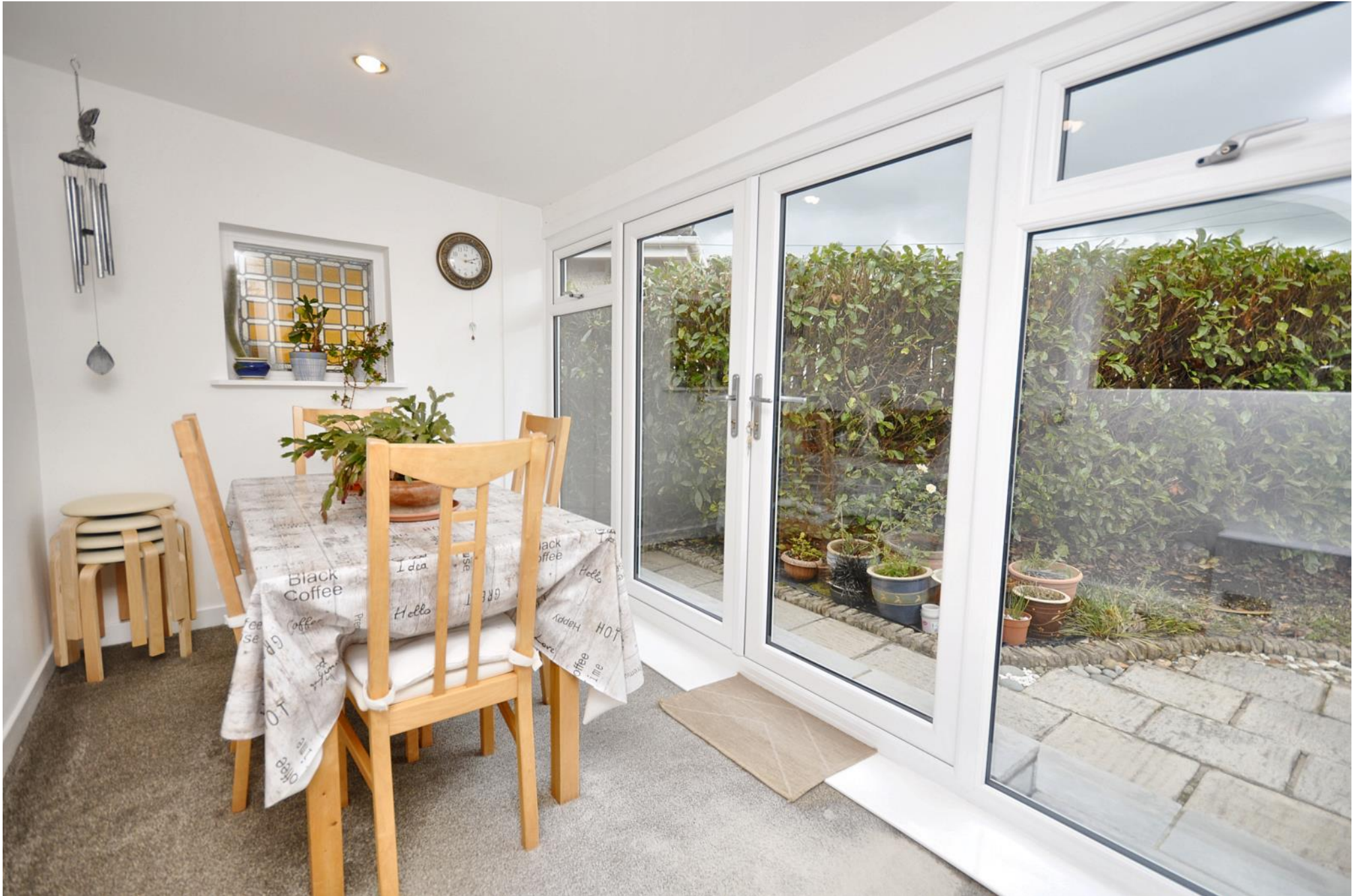
Dining Area/Garden Room