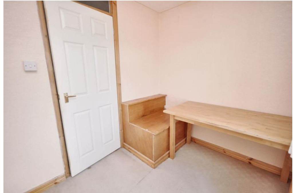
Box Room/ Bedroom 3