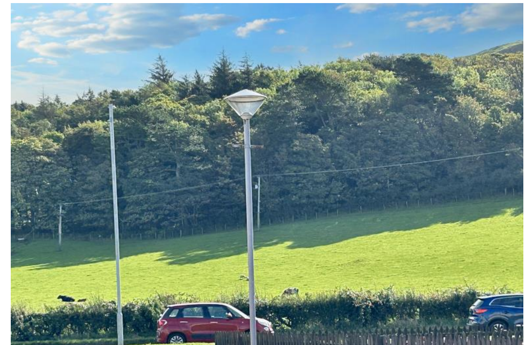
View from Front Garden