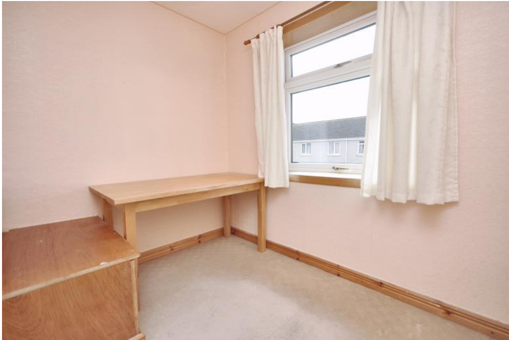
Box Room/Bedroom 3