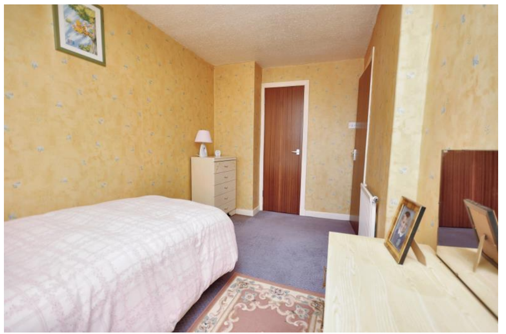
Bedroom 3 Bedroom 3