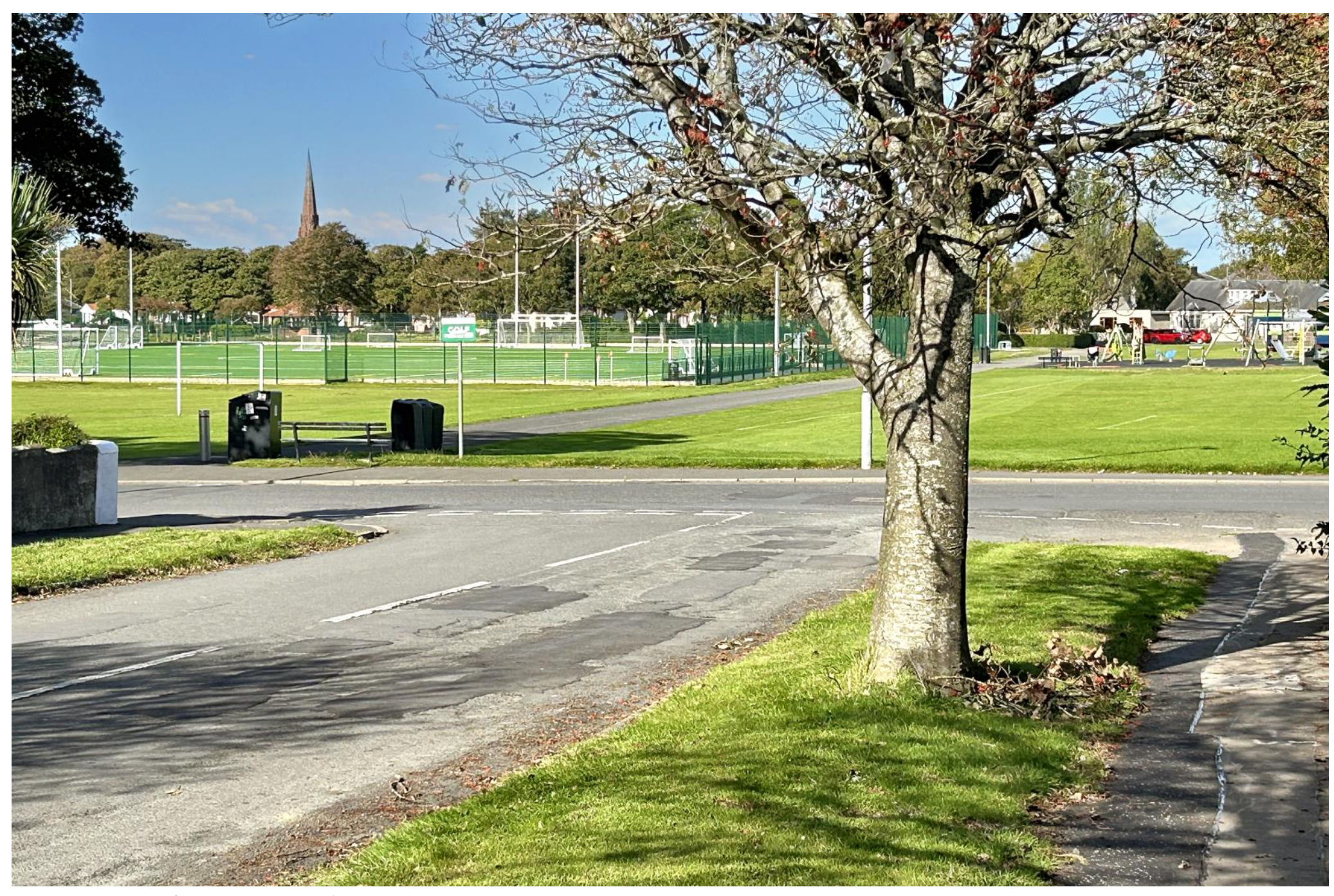
General Surroundings | Victory Park at end of road