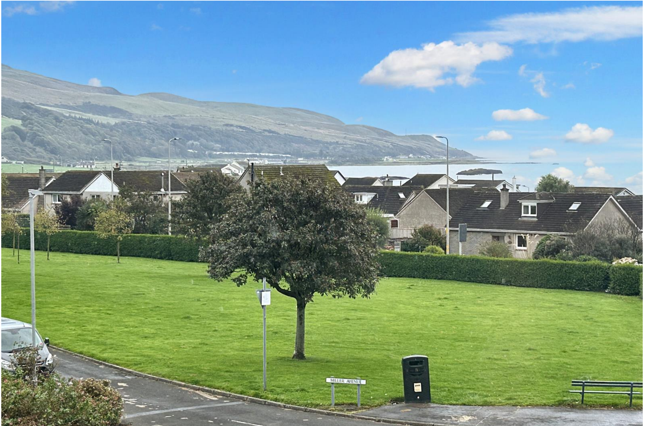
View from front of house