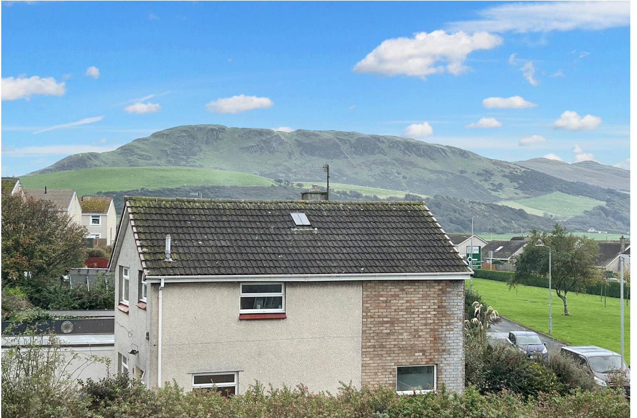
View from upstairs