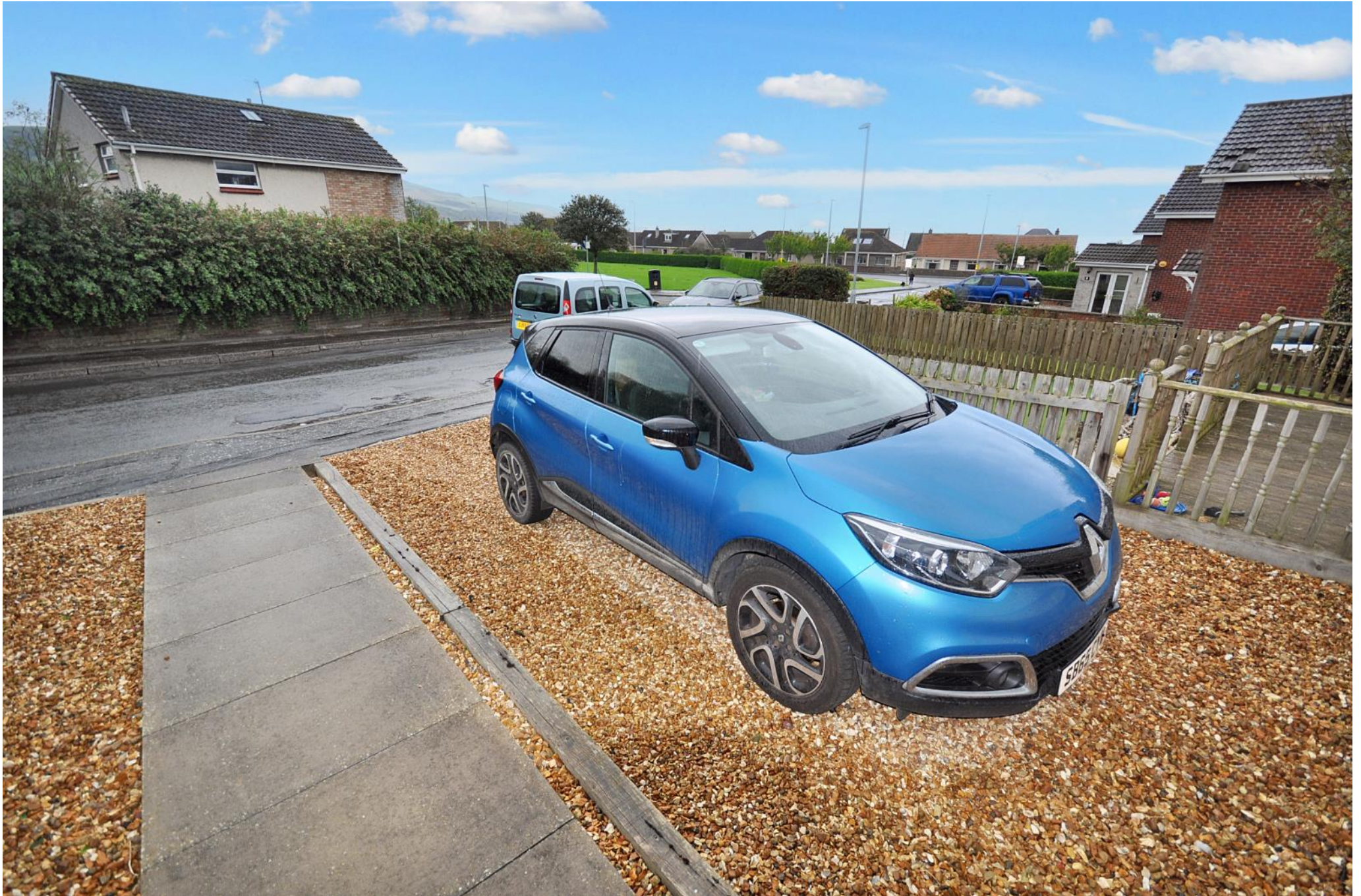
Off Street Parking