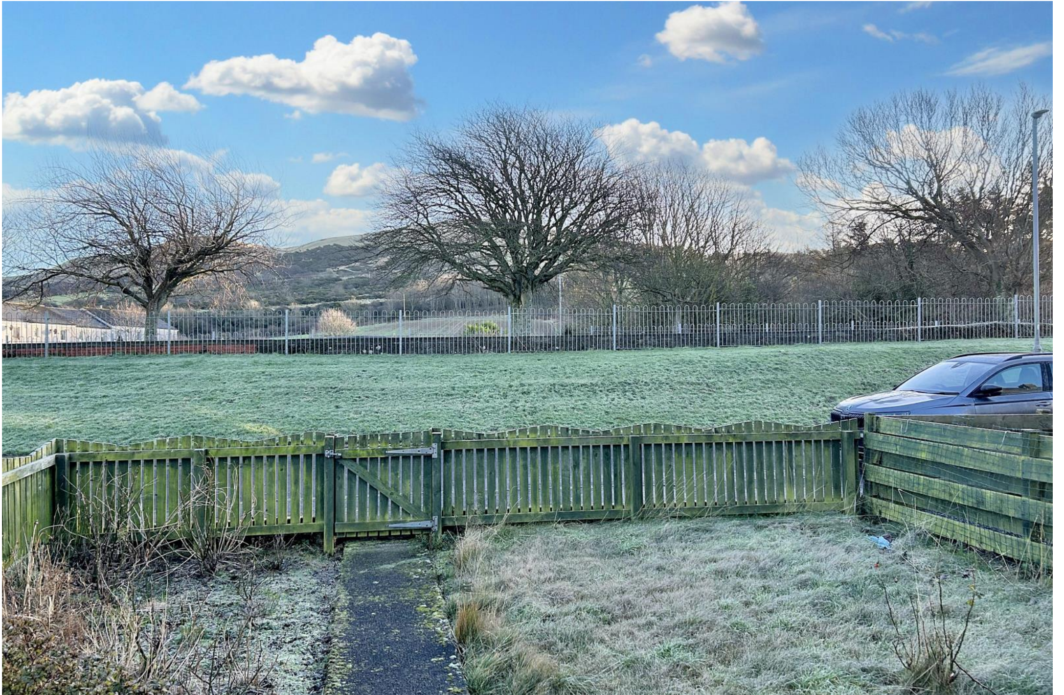
View from front