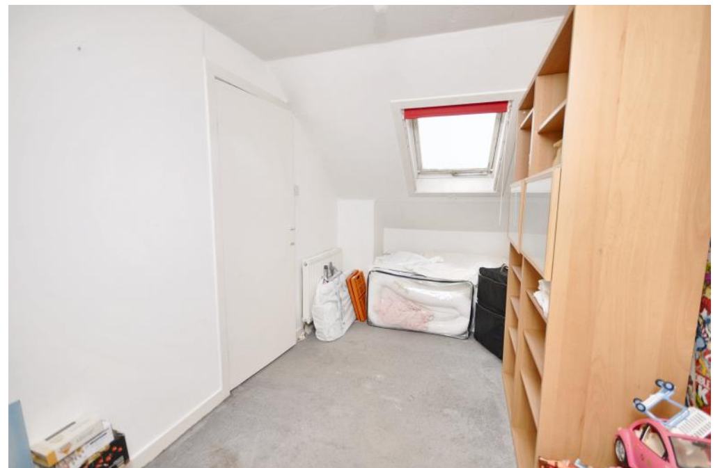
Floored & Lined Attic Space 2