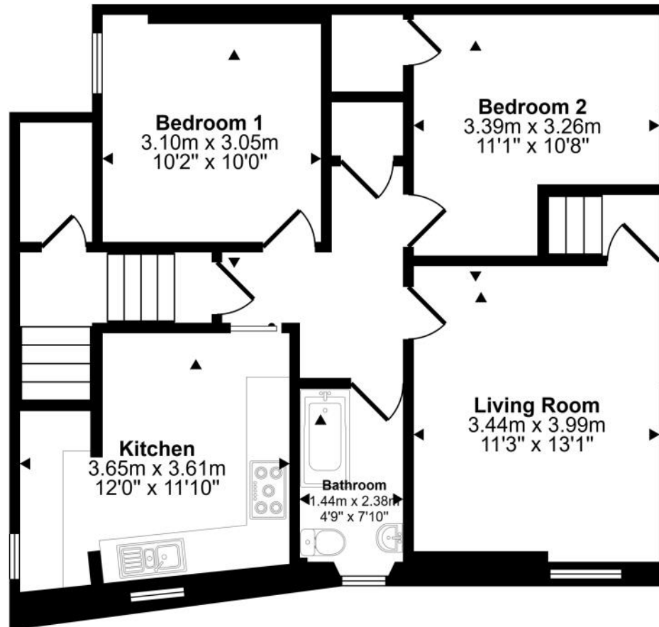
First Floor Approx 66 sq m / 710 sq ft

Approx Gross Internal Area 104 sq m / 1120 sq ft