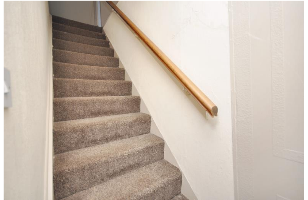
Stairs to Floored & Lined Attic