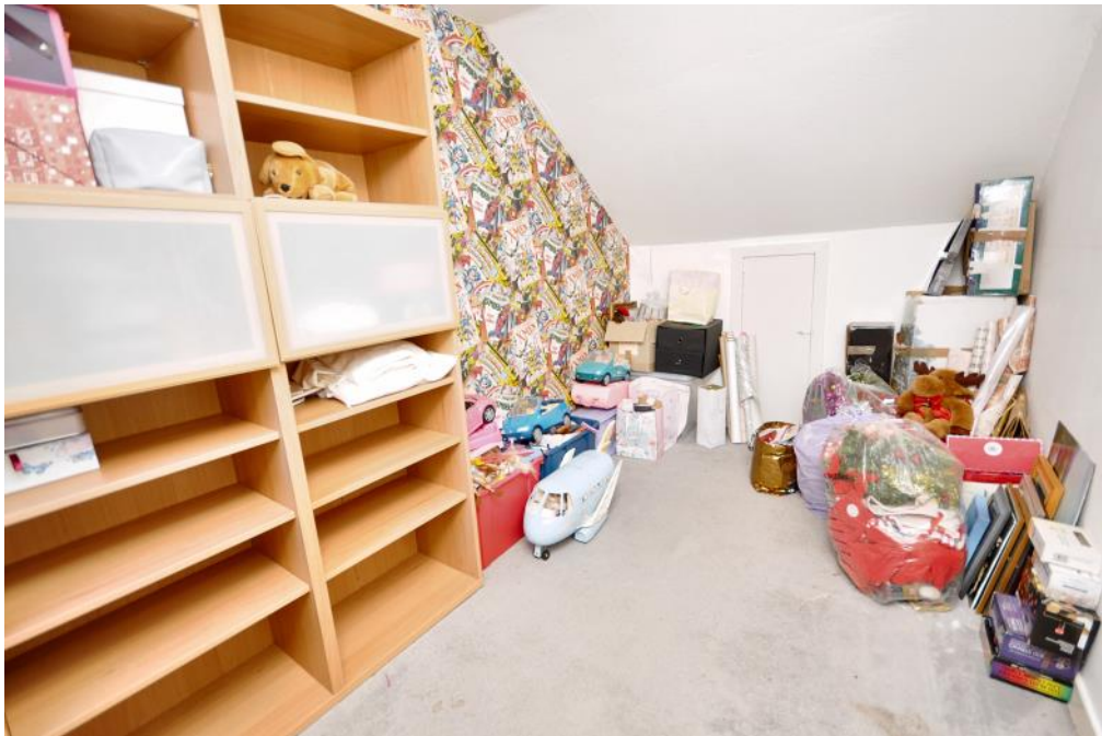
Floored & Lined Attic Space 2