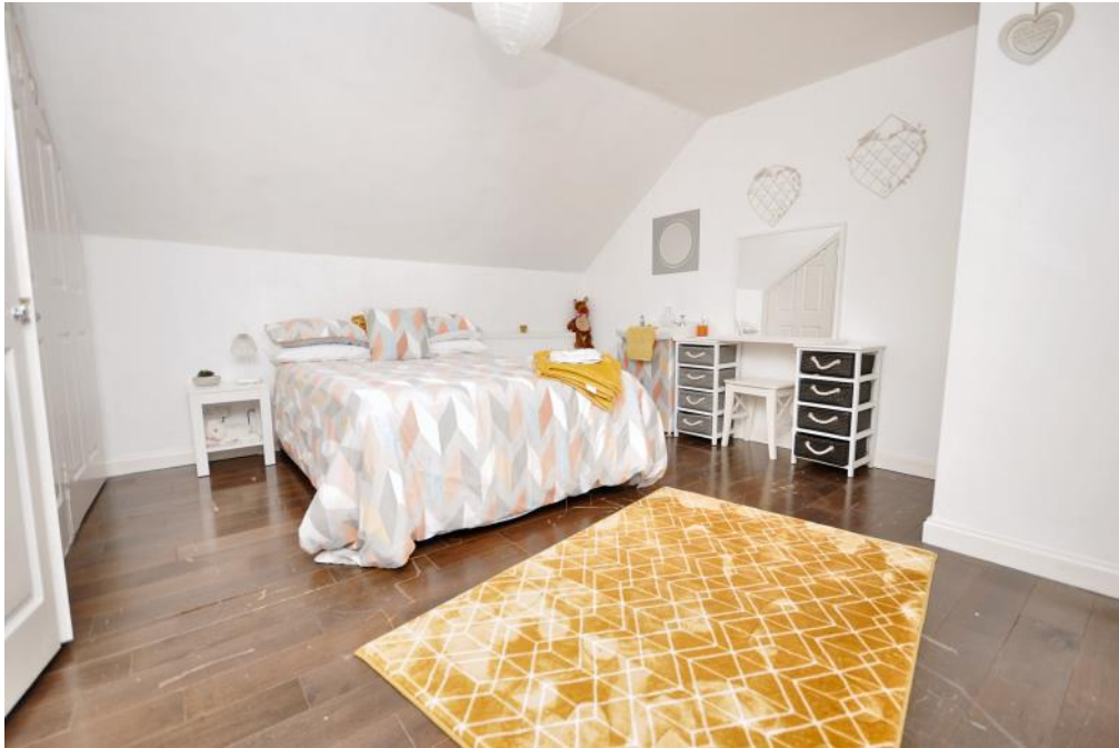
Floored & Lined Attic Space 1