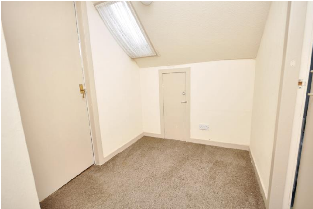
Floored & Lined Attic