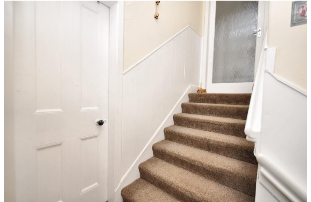
Stairs to inner door