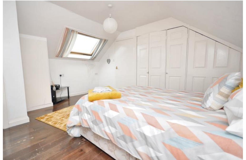
Floored & Lined Attic Sapce 1