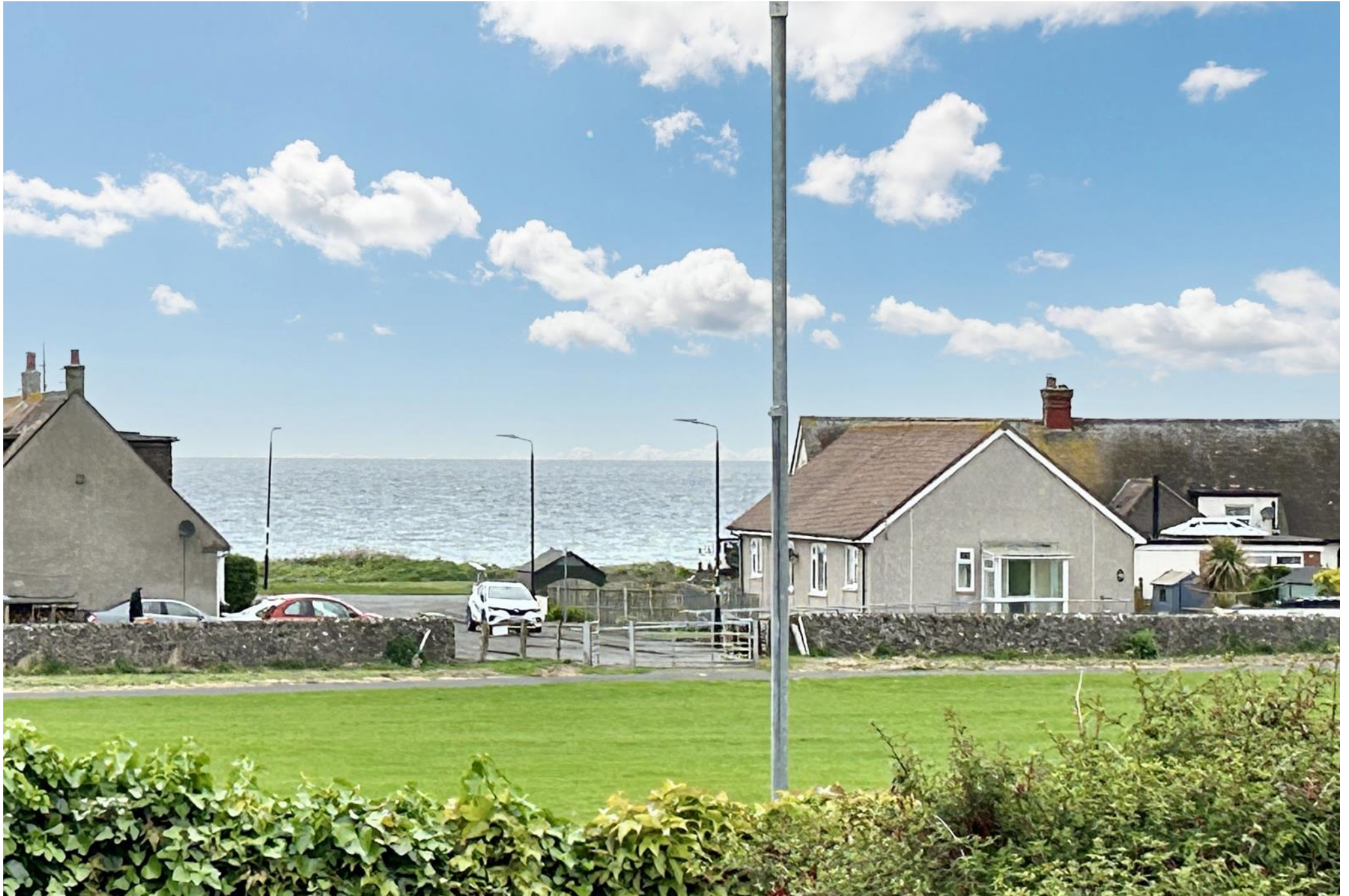
View From House