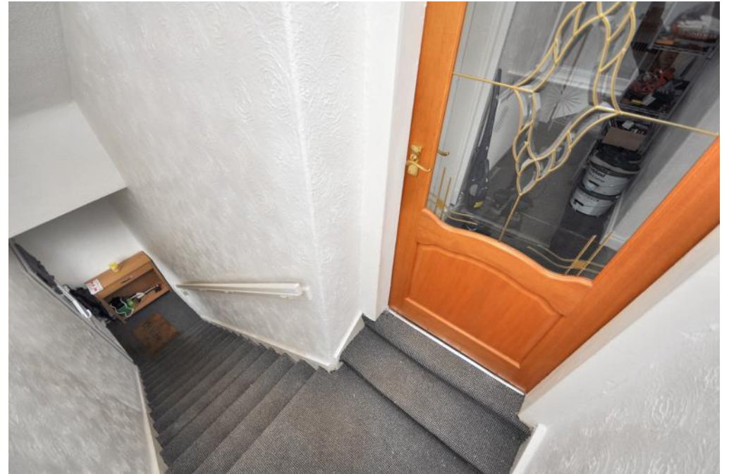
Entrance Door From Stairs