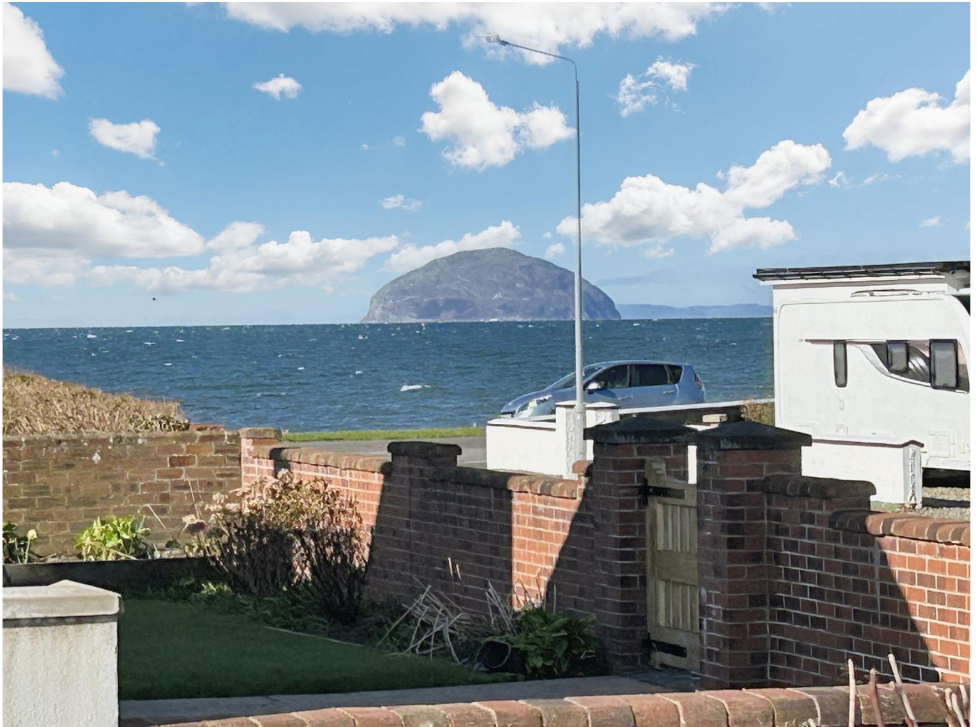
View from Garden