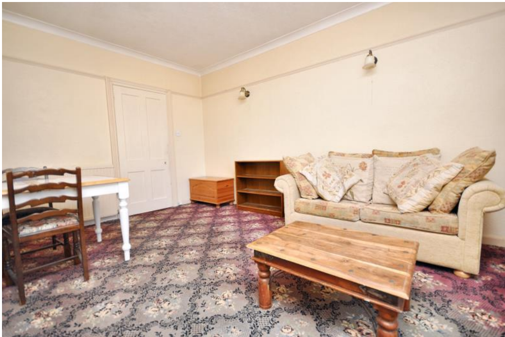
Dining Room/Sitting Room