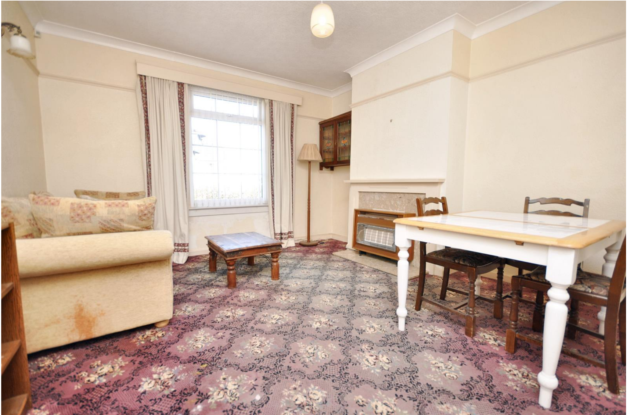
Dining Room/Sitting Room