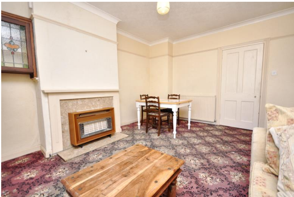
Dining Room/Sitting Room