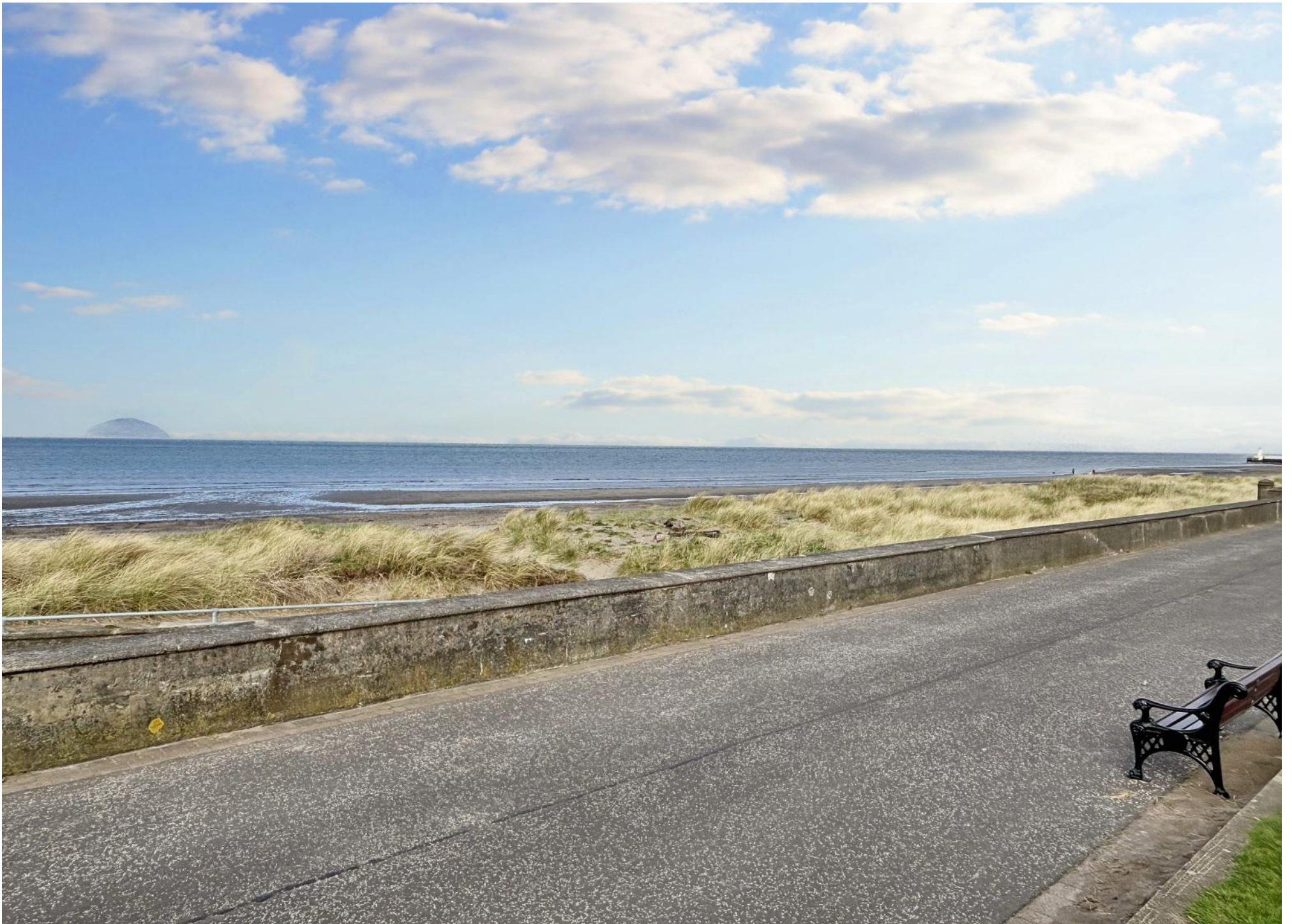
Beach | 2 minutes walk from house