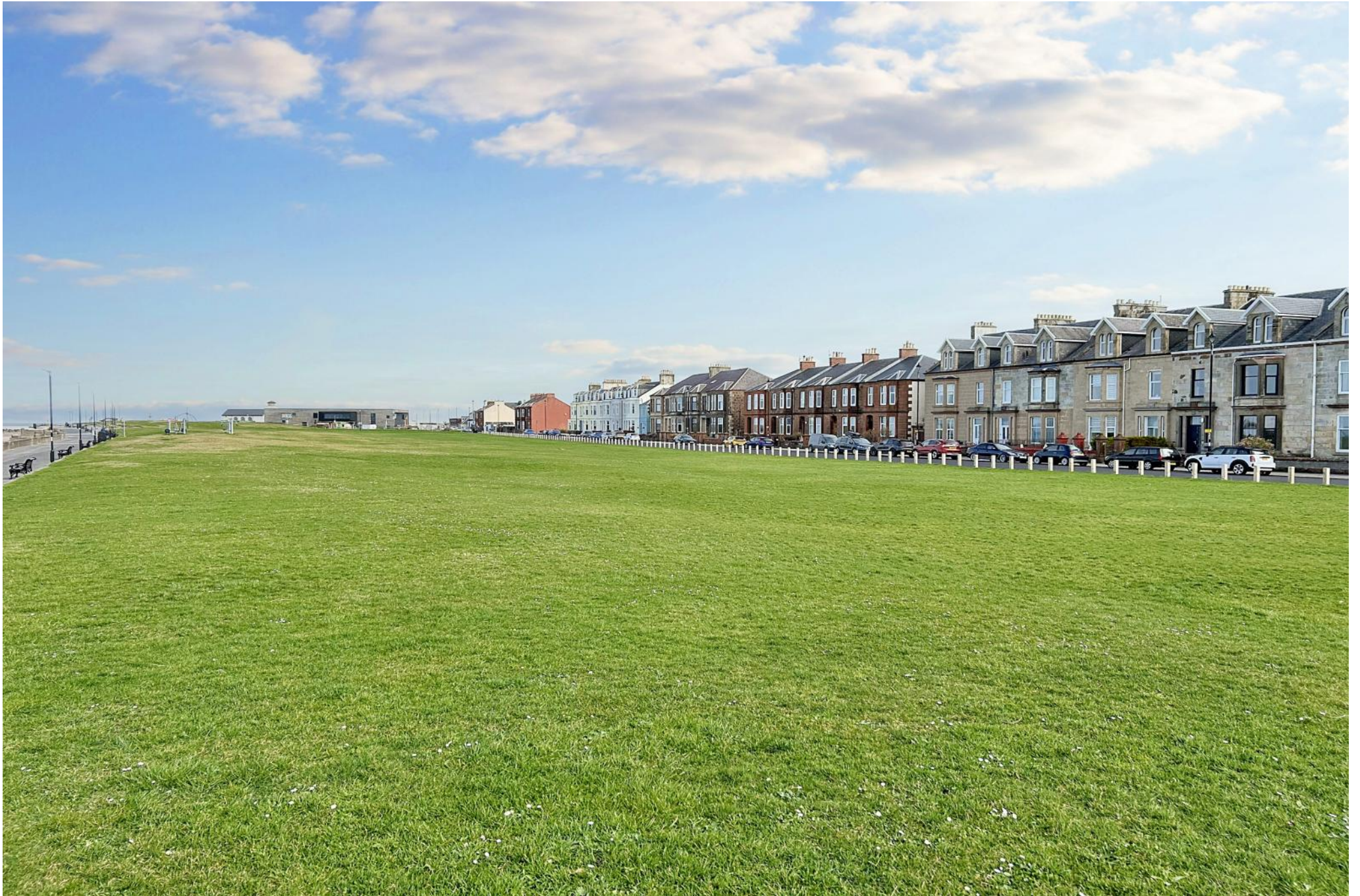
Louisa Drive | 2 minutes walk from house