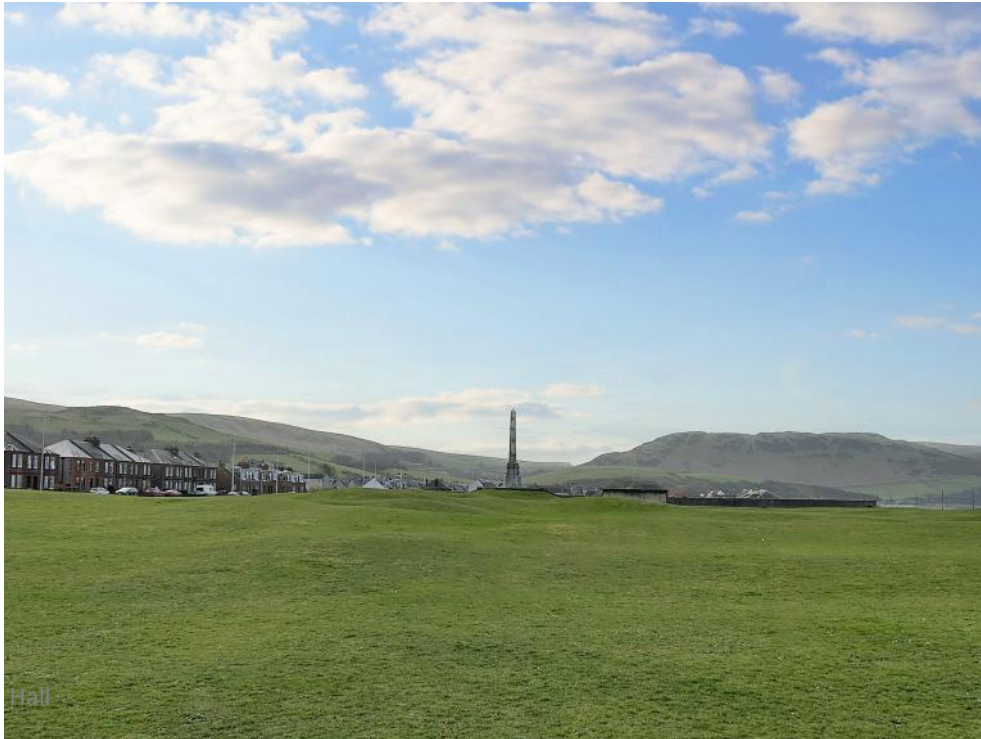
Stair Park | 2 minutes walk from house