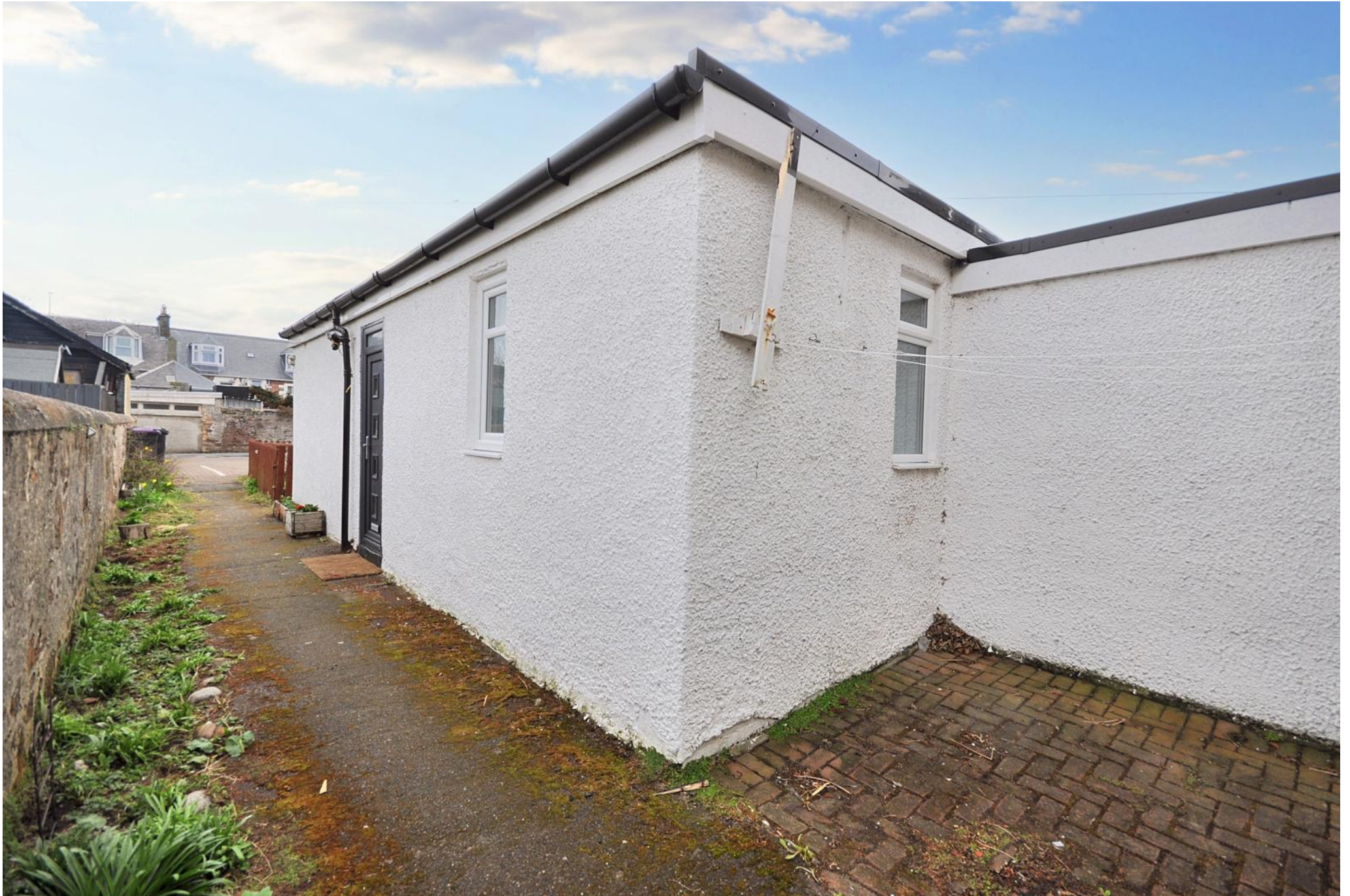
Side of house