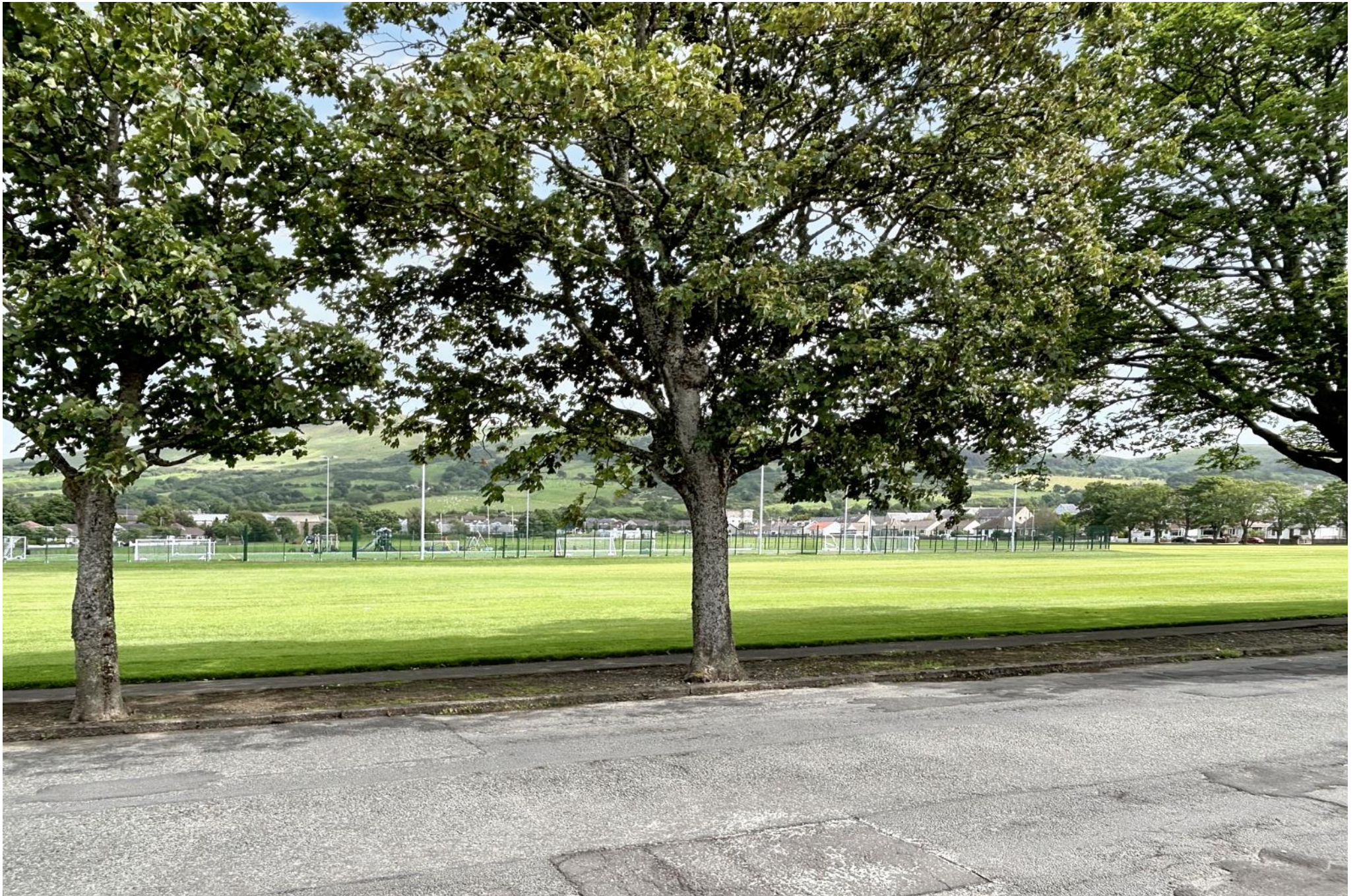
View | outlook over Victory Park