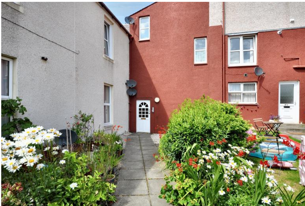
Entrance to Flat