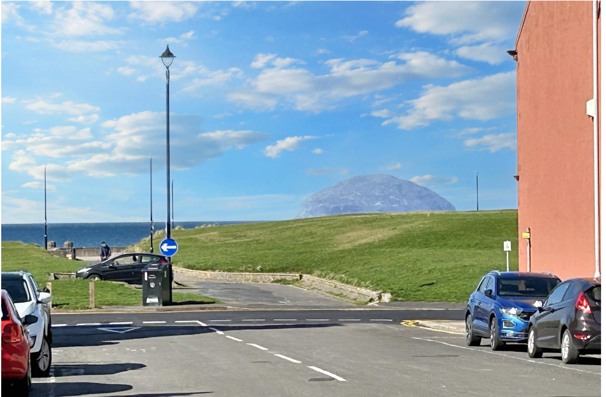
View from Ailsa Street West