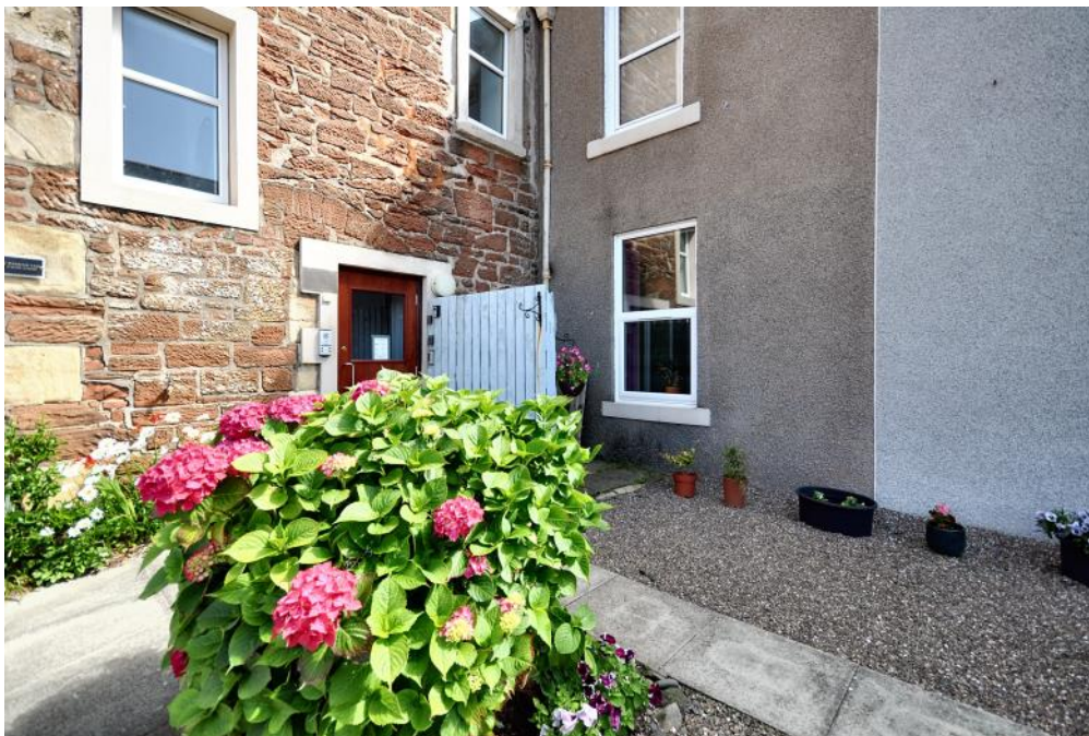
Entrance to building