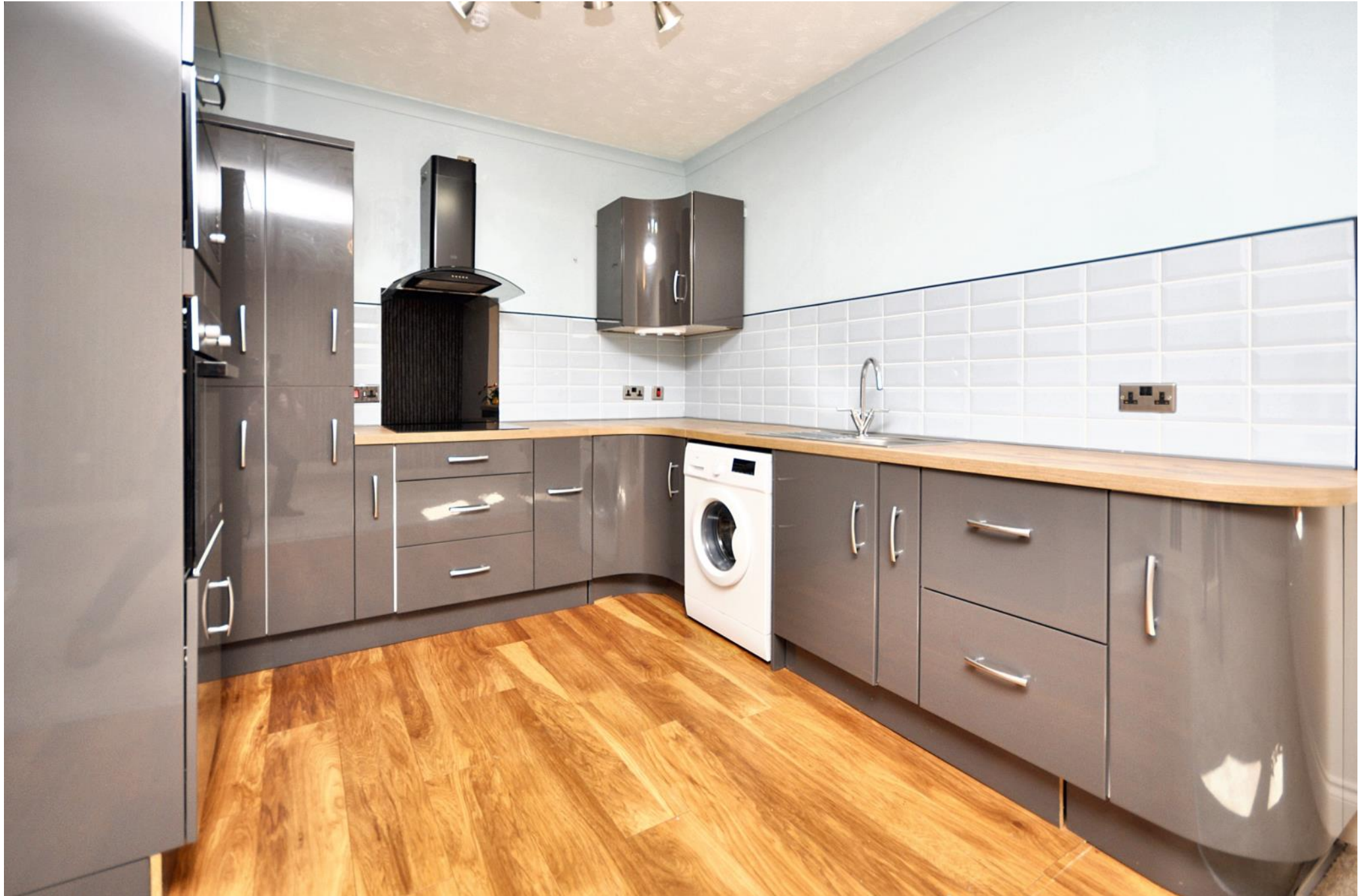
Living Room/ Kitchen