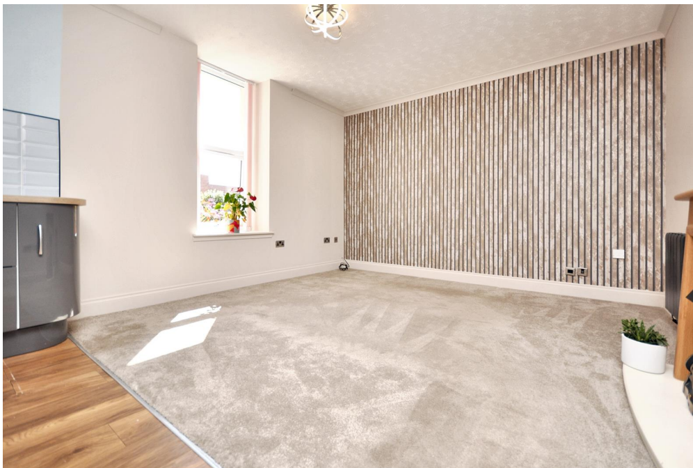
Living Room / Kitchen