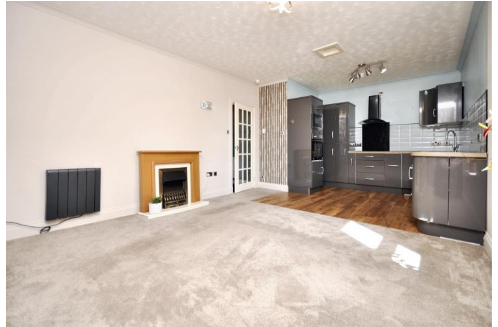
Living Room/ Kitchen