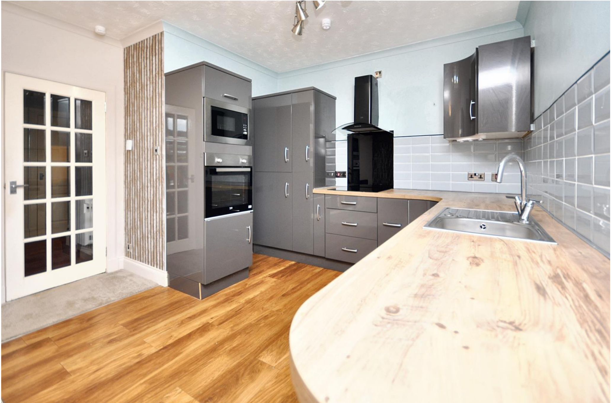
Living Room/ Kitchen