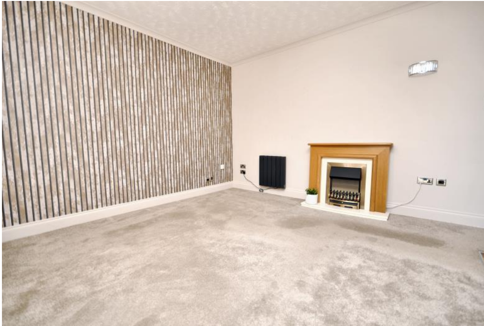
Living Room/ Kitchen