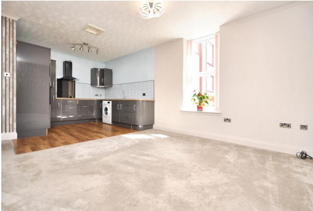
Living Room/ Kitchen