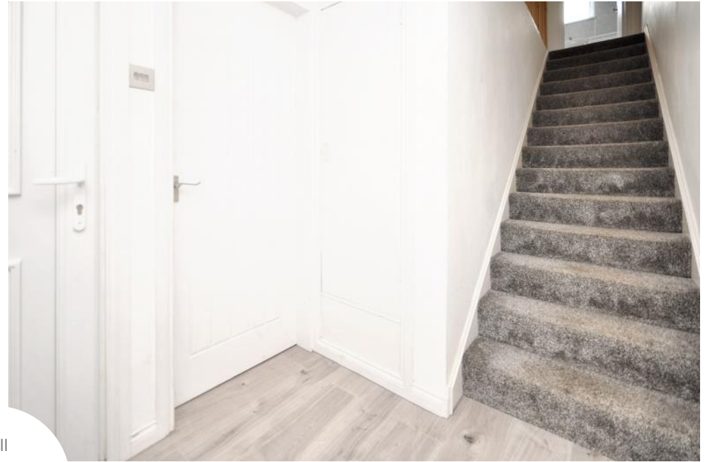
Hall & Landing