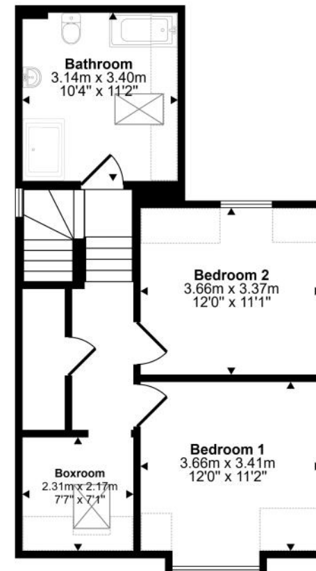
First Floor Approx 55 sq m / 591 sq ft