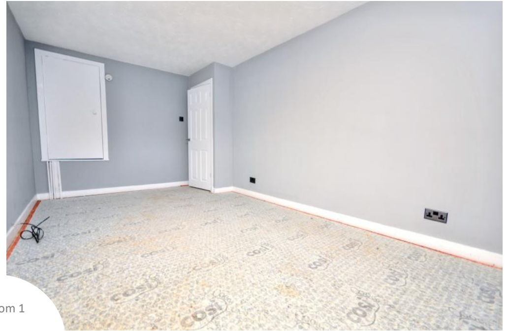
Bedroom 1 & Bedroom 2