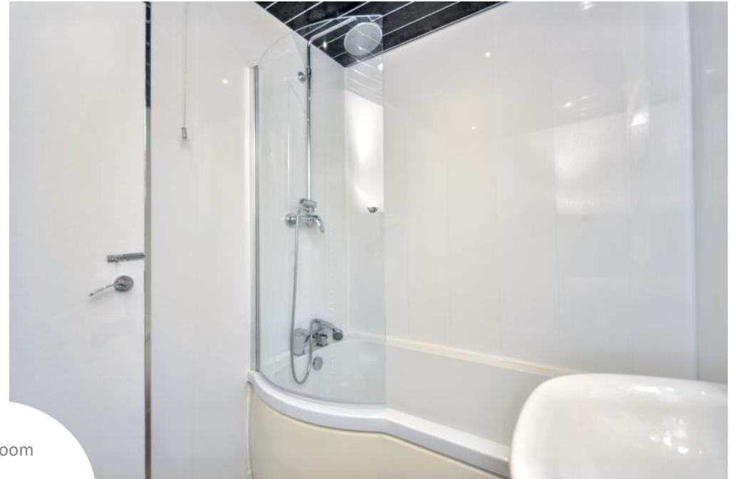
Bathroom & Front Garden