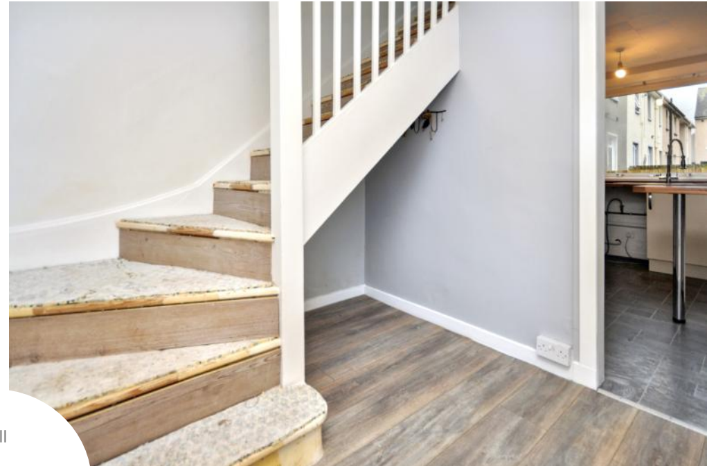
Hall Living Room Kitchen