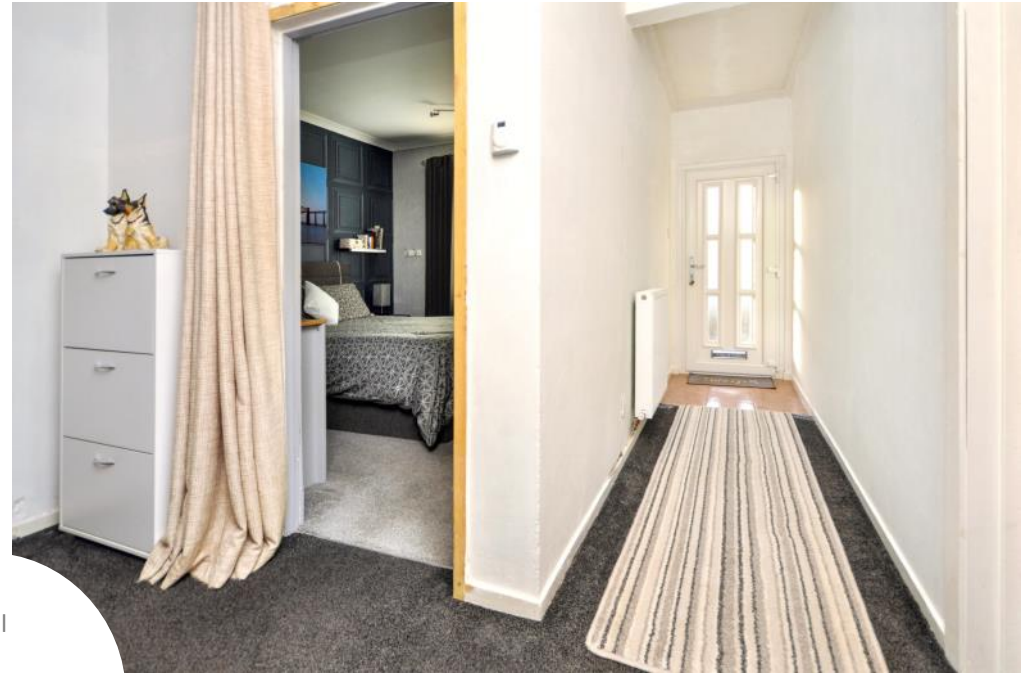
Hall & Shower Room