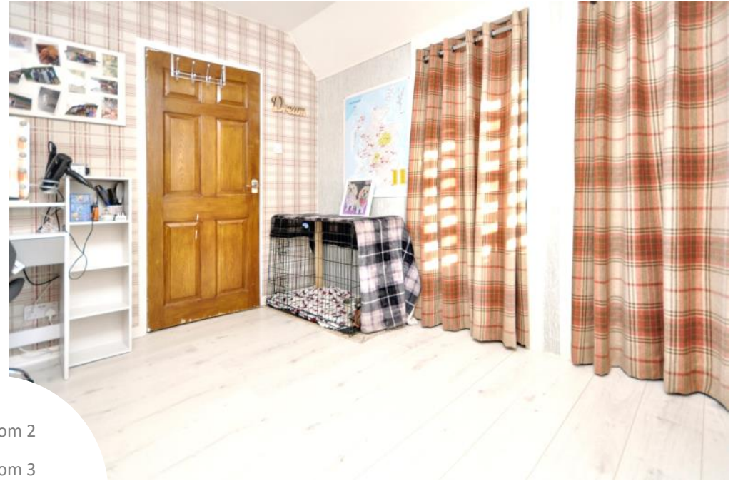
Bedroom 2 Bedroom 3 & Living Rm