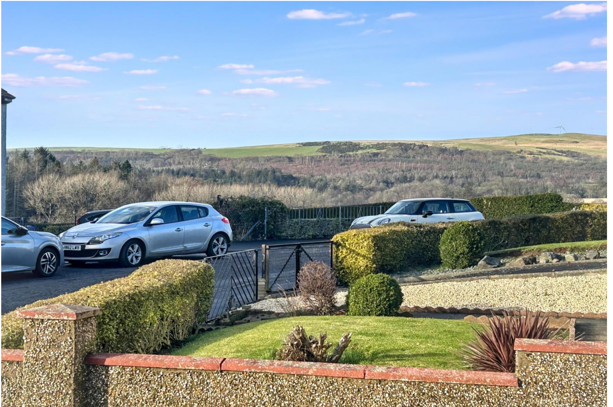
View from front garden