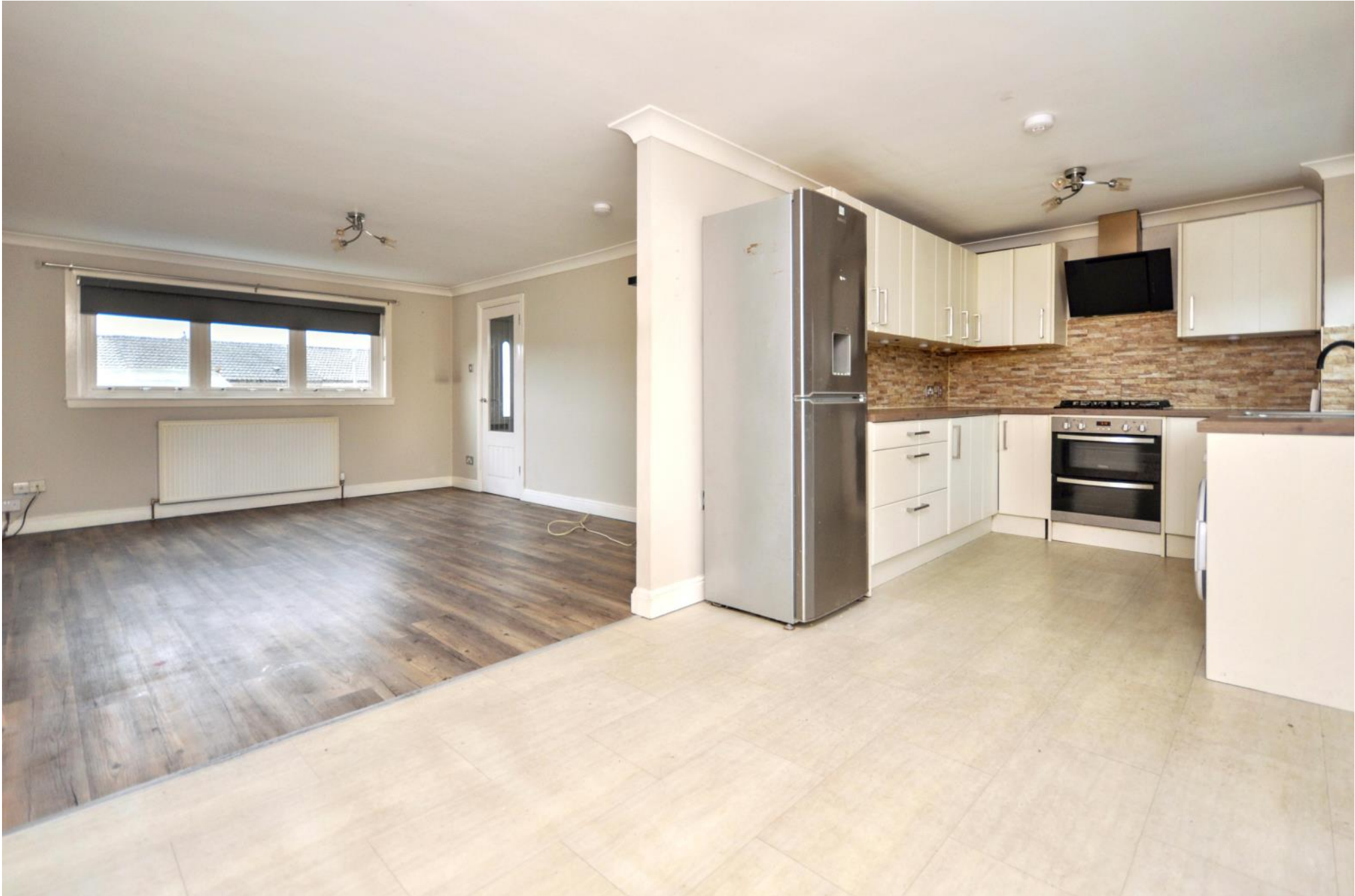
Kitchen and Living Room