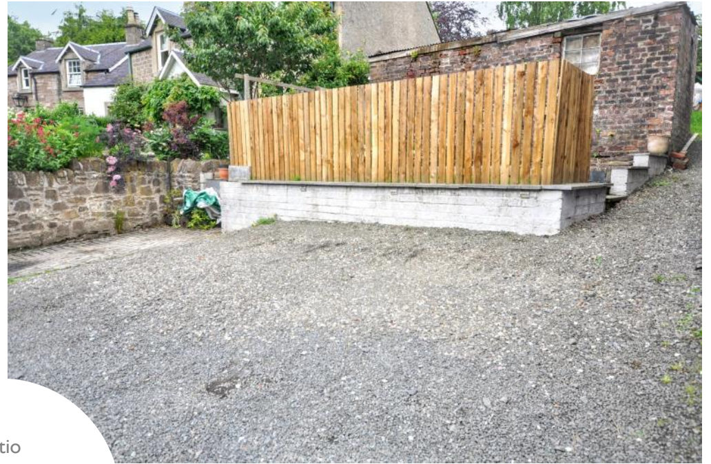
Patio Parking Front of building